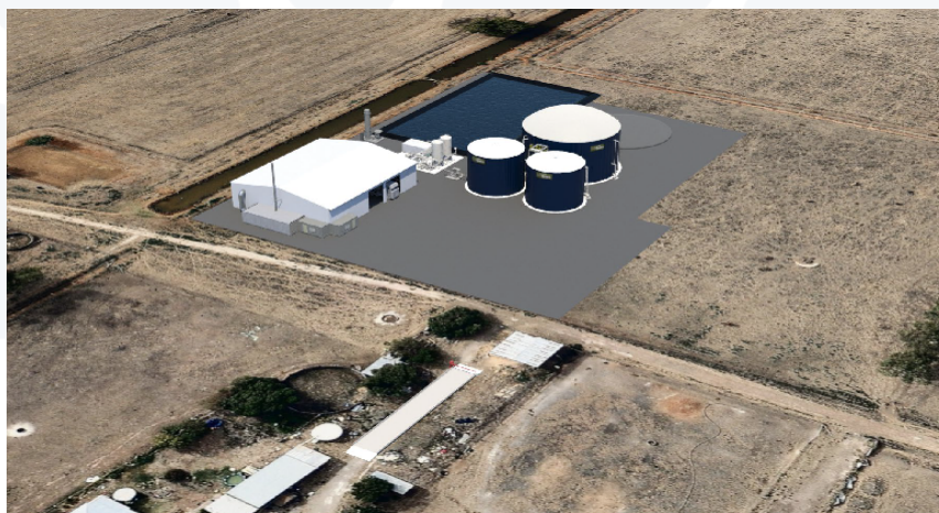
Figure 1: DEVO Site Layout

Construction is expected to commence in July 2021, with the facility being commissioned in July 2022.