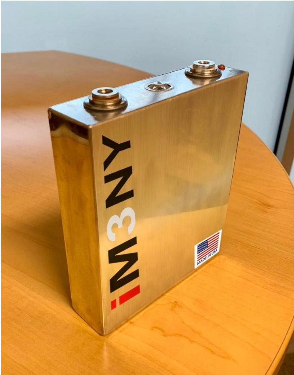
Figure 2: Full-sized Lithium-ion Battery Prismatic Cell produced by iM3NY

While the volumes would increase with fully optimised and automated lines, the current phase works towards production grade design and de-risks design unknowns involved in the transition from pilot production to full scale production.