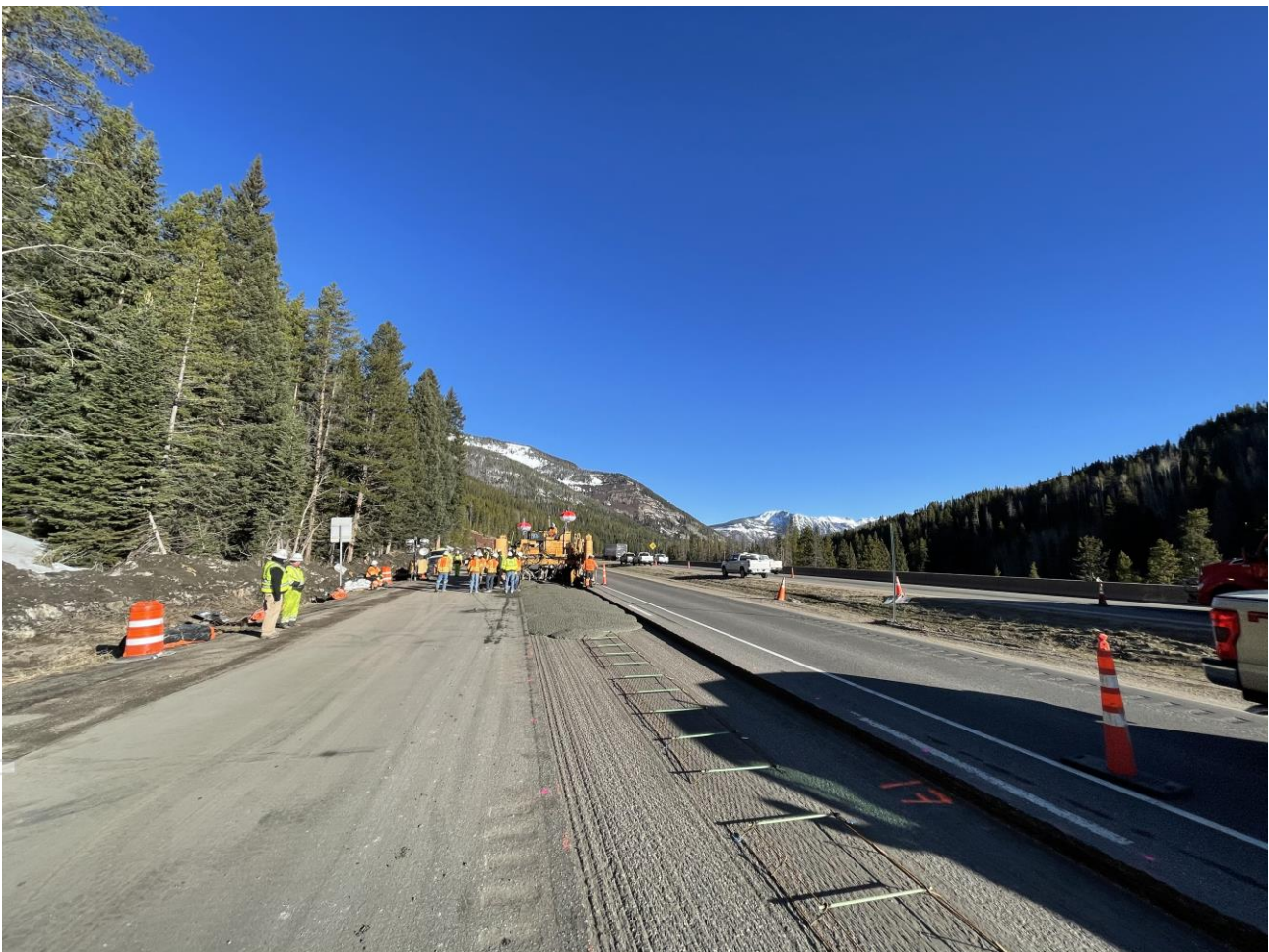
Figure 3. Vail Pass Trial on I-70

The general contractor, IHC Scott (a merger between Interstate Highway Construction and Scott Contracting), provided the milling and paving. Peak Materials was the concrete supplier. IHC Scott placed approximately 600 yd 3 (460 m 3 ) of concrete at a thickness of 6 inches (15 cm) in the drive lane at Mile Marker 184 on eastbound I-70. Each of the three mixes were placed in approximately 200 yd 3 (153 m 3 ) increments (see Figures 3 and 4).