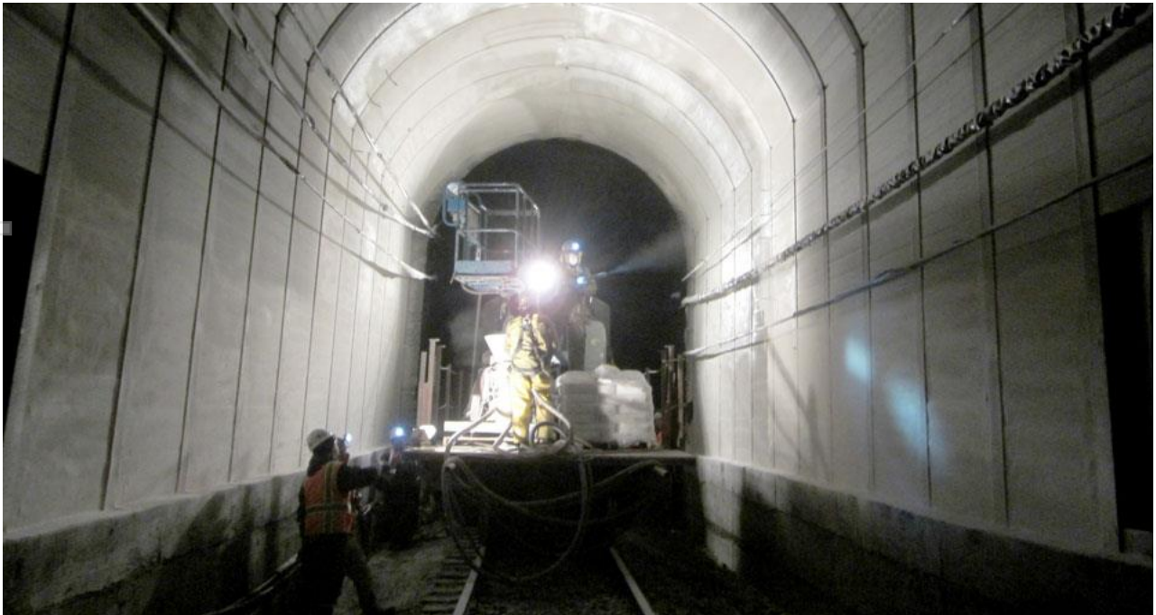
Figure 2. The interior of the Moffat Tunnel photographed during an earlier repair project (not involving EdenCrete®)