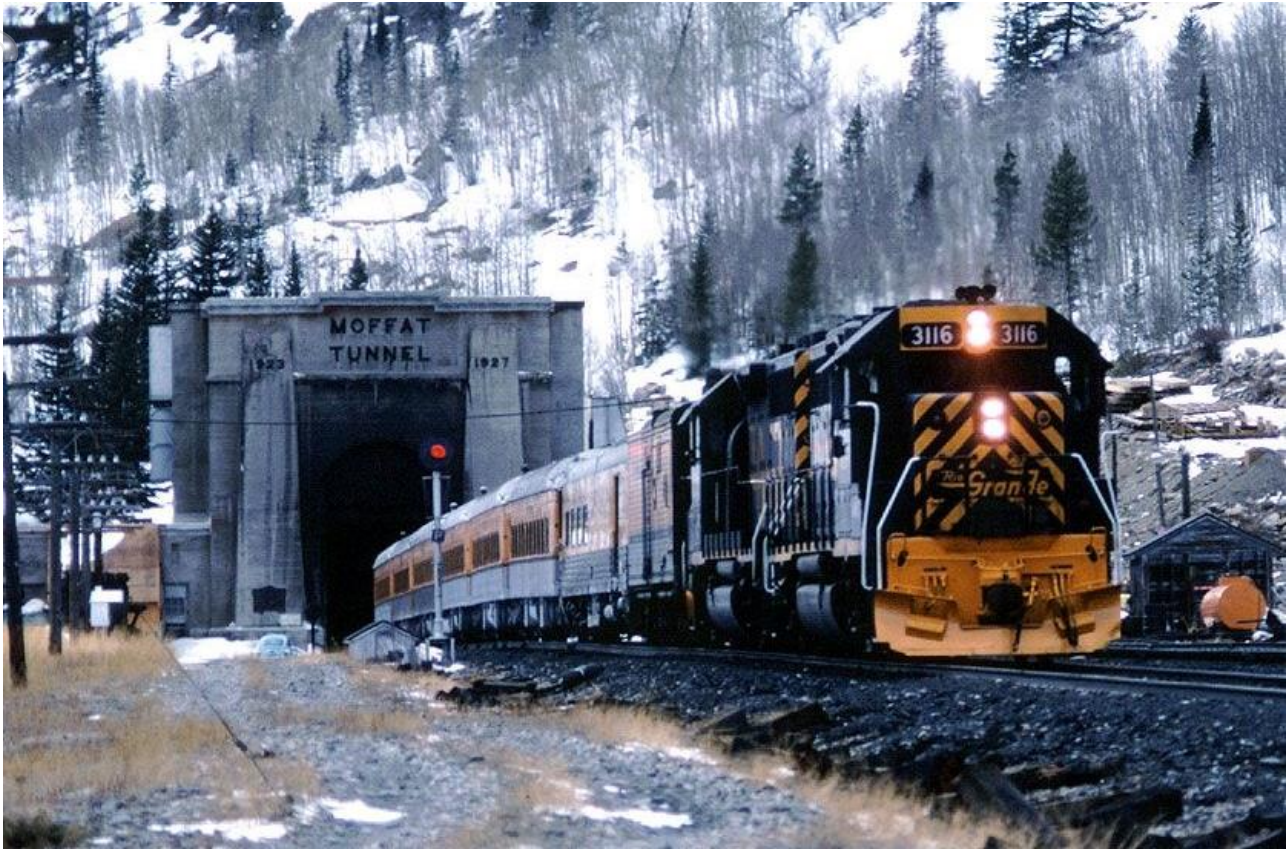
Figure 1. The East Portal of the Moffat Tunnel

Whilst only approx. US$2,100 of EdenCrete® will be purchased, this contract represents a significant milestone, being the first such contract for use in Colorado infrastructure, following success in several extended trials in harsh Colorado conditions.