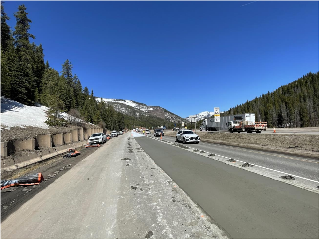
Figure 4. Vail Pass Trial on I-70