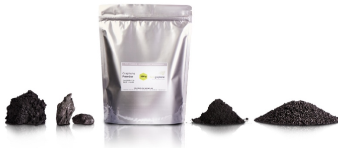
Figure 1 – PureGRAPH® products left to right; AQUA hydro-gel, high purity vein Graphite, standard vacuum sealed shipping pack, Powder and MB-LDPE Pellets.

A Masterbatch is a solid additive used in the plastics industry. It is a concentrated mixture of pigment, reinforcing material and/or other additives encapsulated within a suitable carrier resin, typically produced using extrusion technology. The mixture is then cooled before being fed into a pelletiser to be cut and formed into chips.