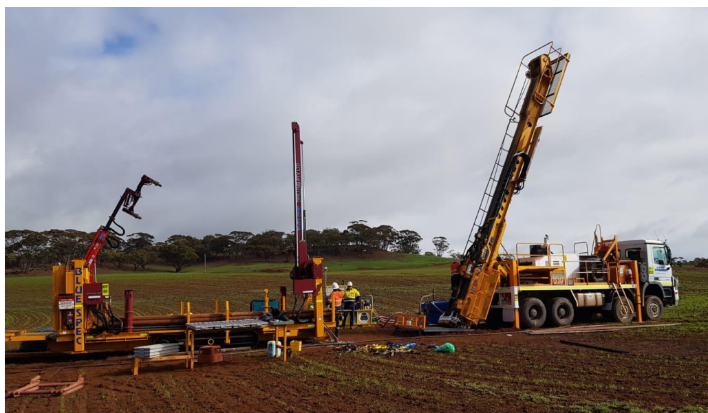
Diamond Drilling Rig at MNEWDD01

Once complete, drill holes will be cased ahead of a down-hole EM (DHEM) survey designed to identify any off-hole EM conductors.