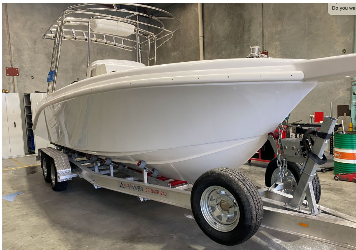
Figure 3 – The Ascent Shipwright 23ft centre console pleasure boat.

Mr Roberts said: "Having successfully added PureGRAPH® into our manufacturing process and having seen the benefits in real world sea trials, we are committed to continuing the use of PureGRAPH® in all our GRP boats."