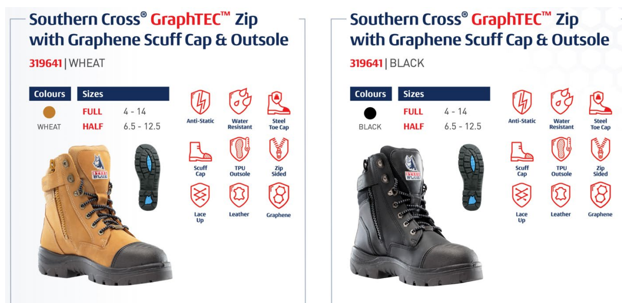
Figure 2 - The Steel Blue Southern Cross @ GraphTEC™ safety boots.

Mr Johnson said: "Steel Blue will continue to progress research and development with First Graphene on further enhancing various components of safety footwear and we look forward to bringing these to the market to supplement the GraphTEC™ range of PureGRAPH® enhanced boots."