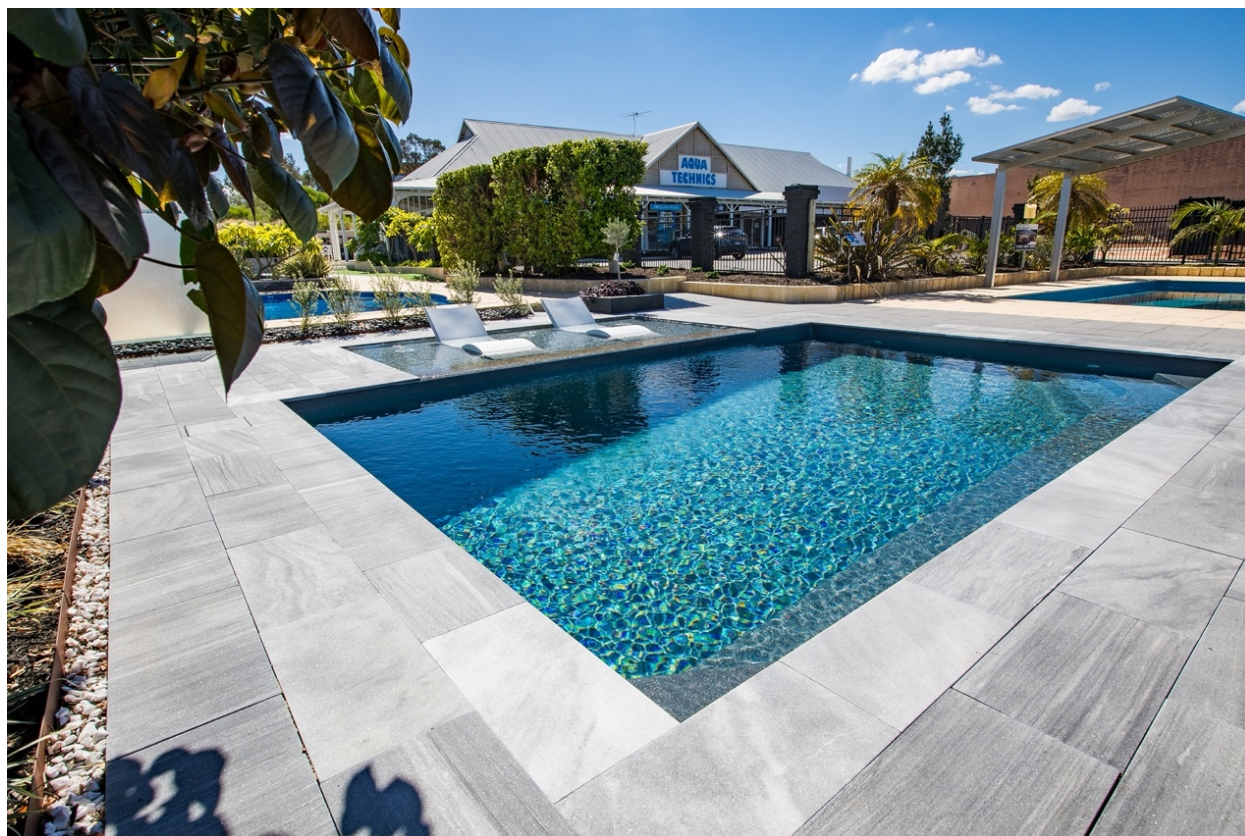
Figure 1 - The Aqua Technics Avellino 6m x 4m Graphene Nano-Tech pool.