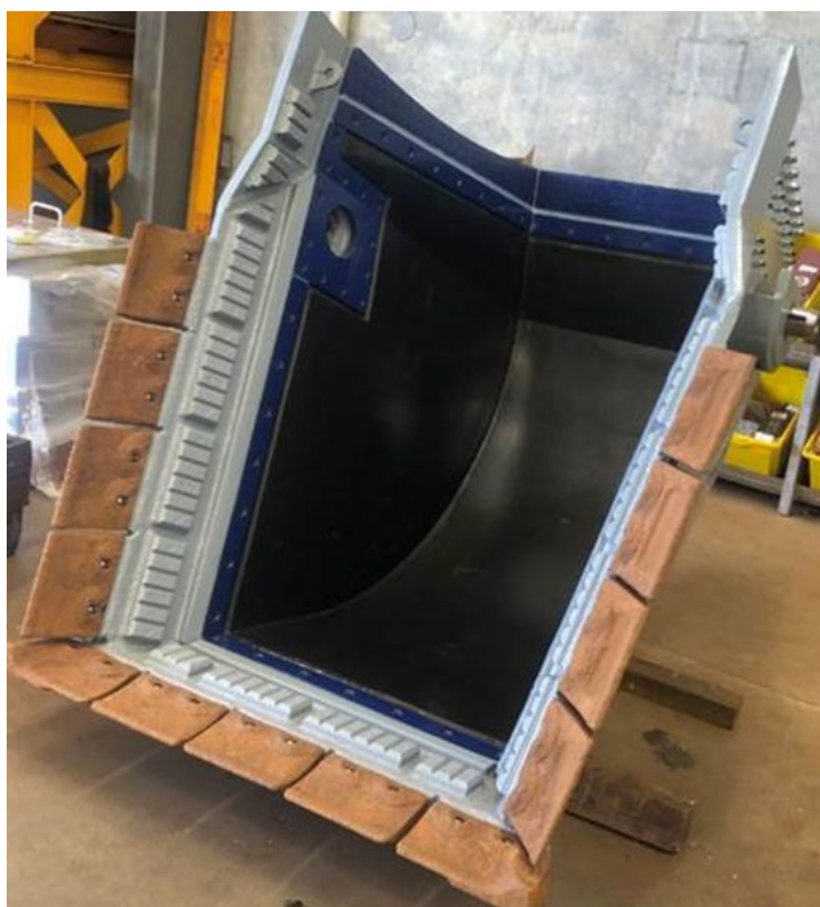
Figure 4 - The newGen Group ArmourGRAPH Bucket Reclaimer wear liner.