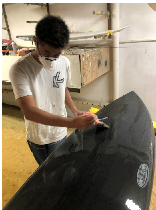
Figure 5 – The Graphene enhanced Katana Surfboard during manufacture.

Mr Smith said: "PureGRAPH® was easily integrated within our existing production process and resulted in improved durability and overall longer life expectancy. Further to this, the feedback from the local surf community that have tested the boards, suggest an improved response on water".