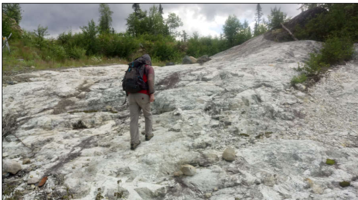
Figure 3 –Surface outcrop of the North Aubry Pegmatite at the Seymour Lake Lithium Project