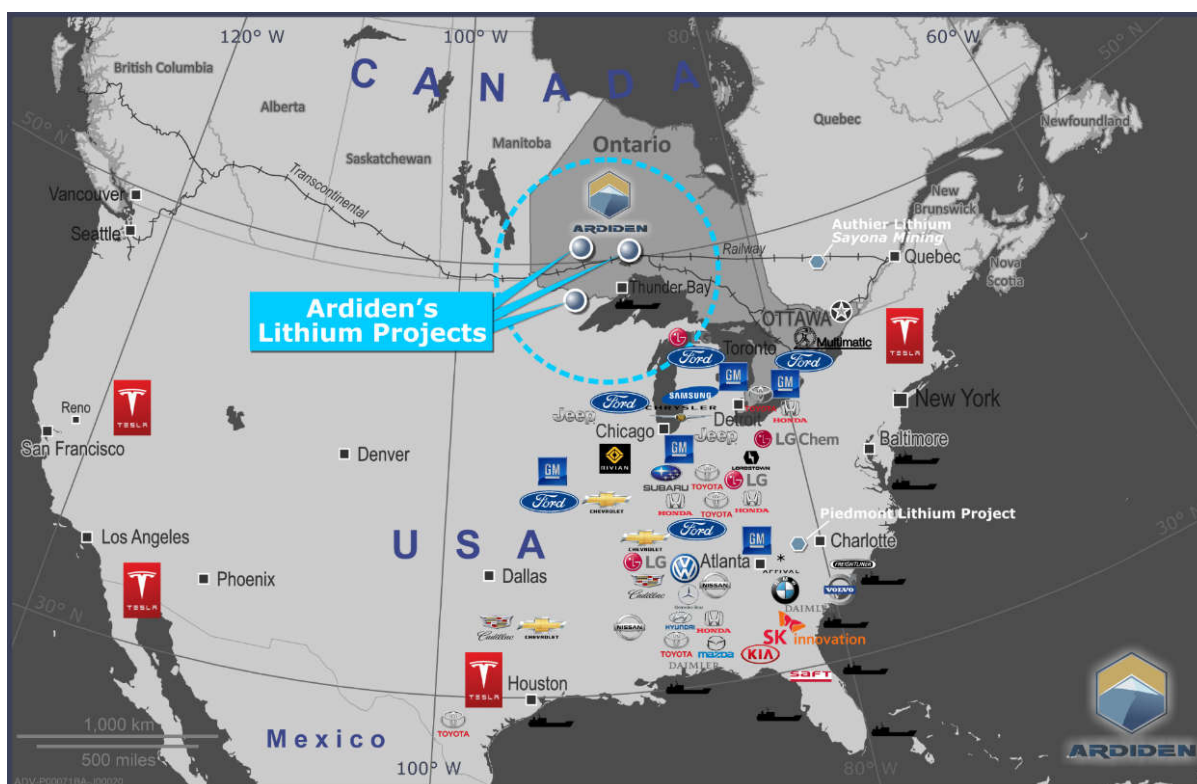
Figure 2 – Location of Ardiden's Lithium assets in relation to the EV Battery Market in North America

This information is authorised for ASX release by the Board of Directors.