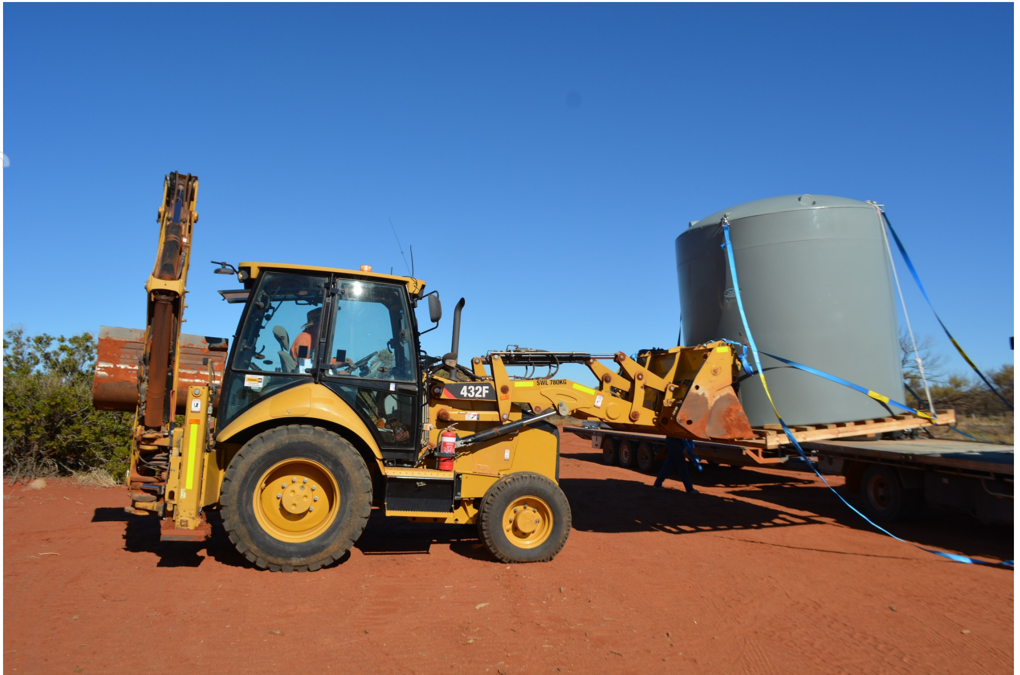
Figure 1: Arrival of new self-bunded 10,000L diesel tank yesterday