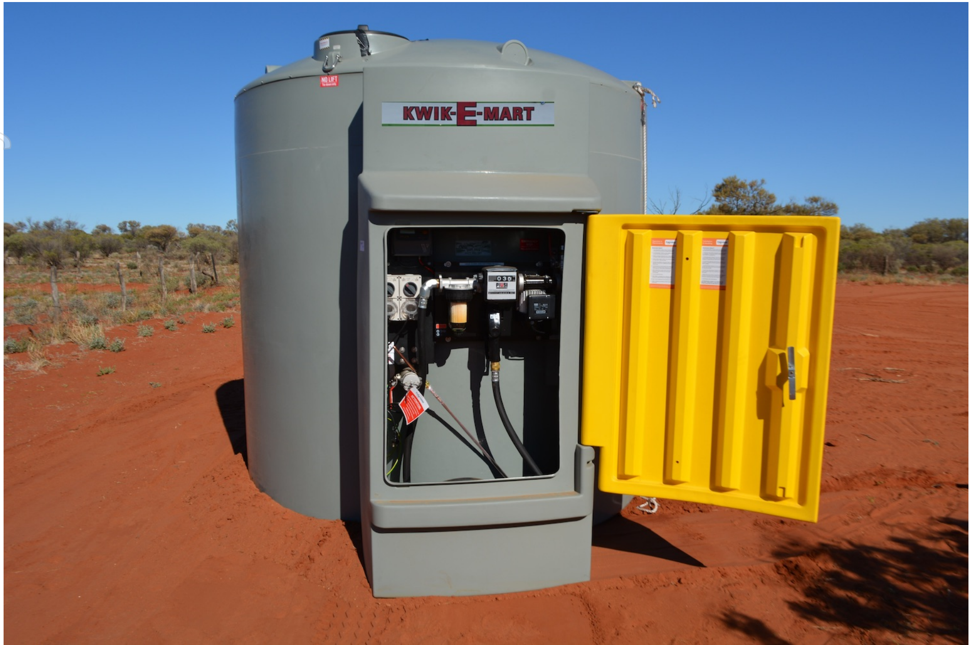
Figure 2: Our new drive-up fuel tank facility