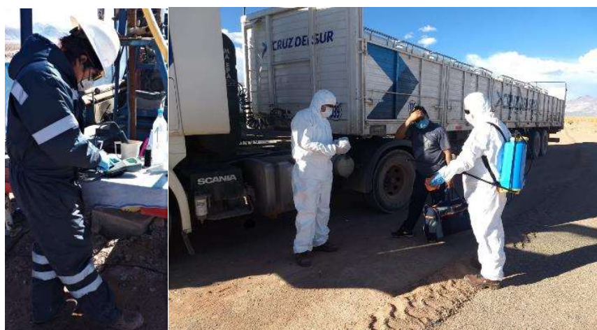
Figure 4. Drill rig operating at Kachi Project; COVID-19 controls.