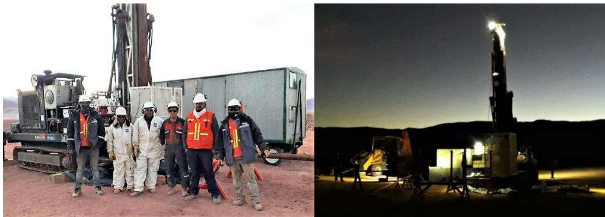
Figure 3. Drill rig operating at Kachi Project