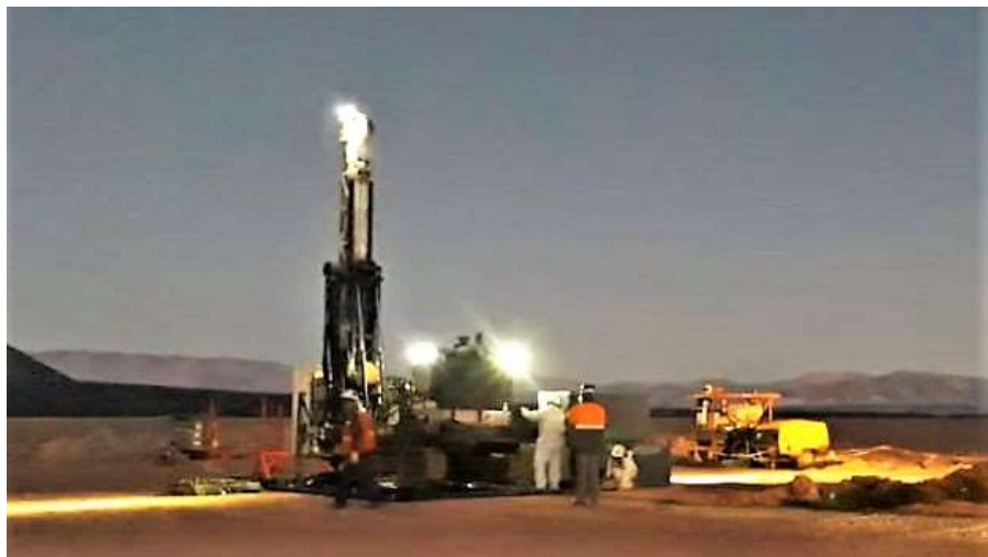
Figure 2. Drill rig operating at Kachi Project