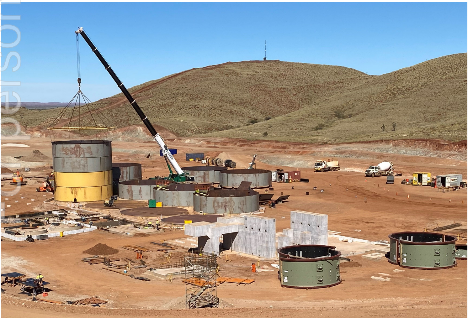
Figure 3: SAG Mill on Site