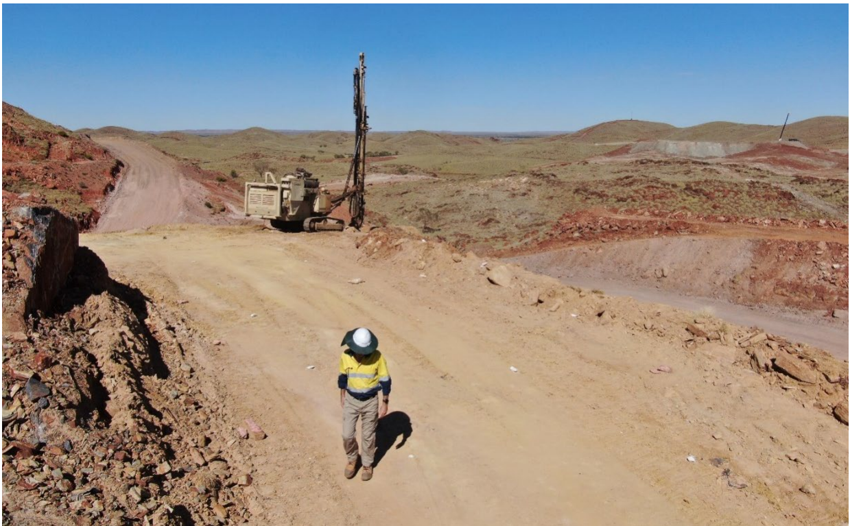
Figure 5: Blasthole Drilling