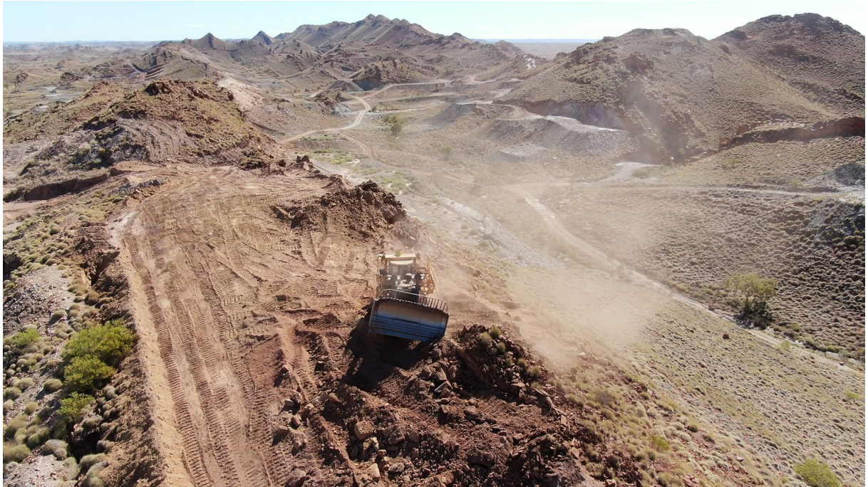
Figure 4: Pioneer Mining Underway