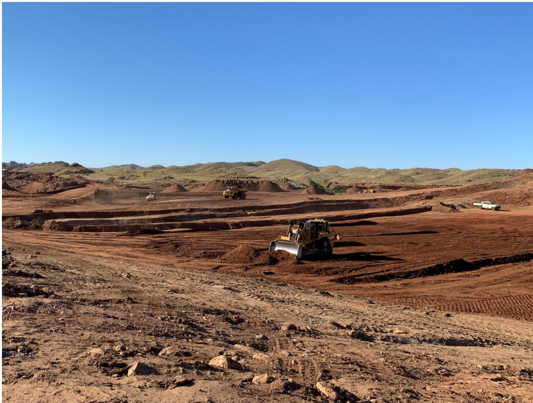
Figure 6: Tails Dam foundation preparation