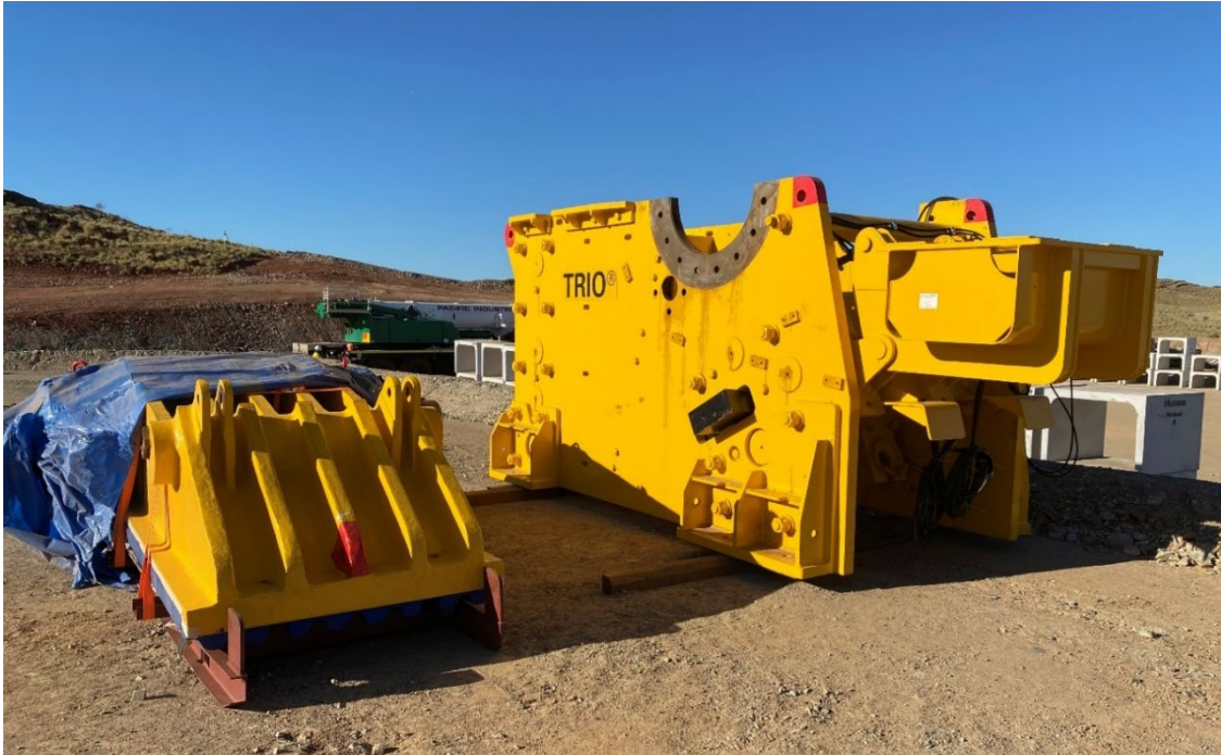
Figure 2: Crusher on Site