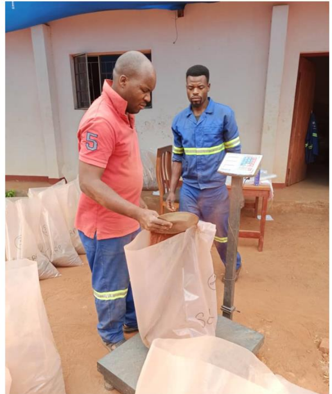
Figure 5: Bulk sample preparations in Malawi prior to despatch to Australia.