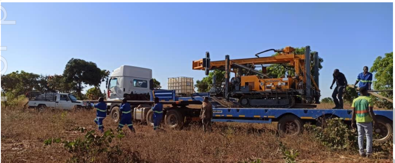
Figure 6: Core rig mobilising at Kasiya

Baseline environmental studies have commenced covering terrestrial flora and fauna, aquatic biology, air quality, surface water and groundwater studies. The Company has continued engagement with all stakeholders from local communities through to the Government of Malawi.