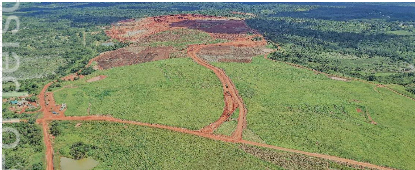
Image: Various stages of land rehabilitation on the Kwale Operations South Dune (foreground) following mining (background).

Rehabilitation activities on the mined-out areas of the South Dune continued in the quarter with community groups supplying indigenous legumes, grass seed and manure.