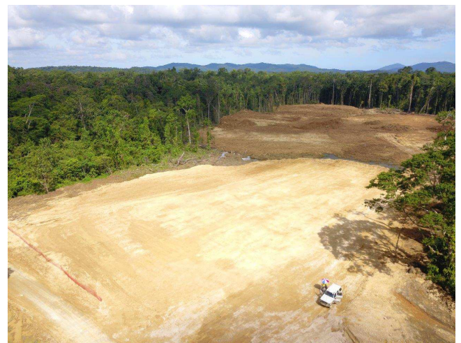
Permanent Camp Pad