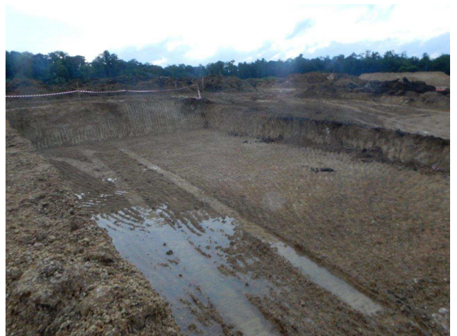
Process Plant Boxcut