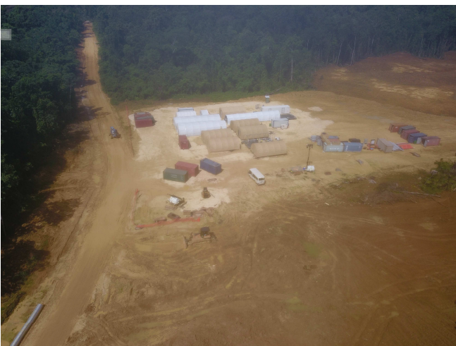
Tented Construction Camp