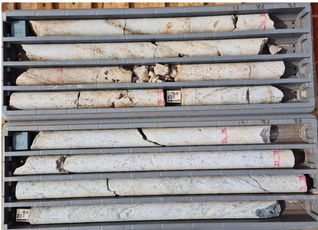
Figure 3 Carbonatite with stylolite joints and vugs. Fine grained disseminated rare earth minerals visible under hand lens. Low level of chlorite alteration from 77.10m onwards.