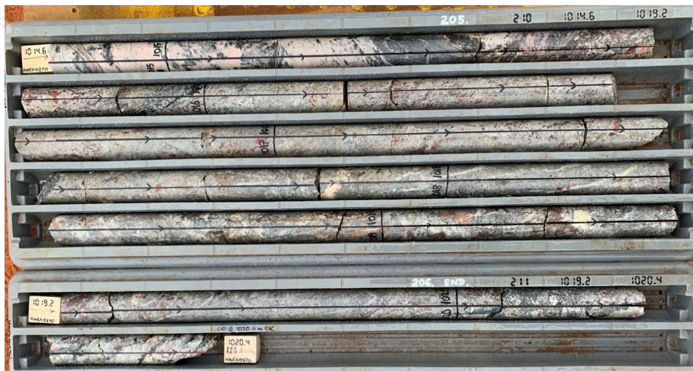
Figure 3 MWEX10270 Drillhole ending at 1020.4m depth in REE mineralisation