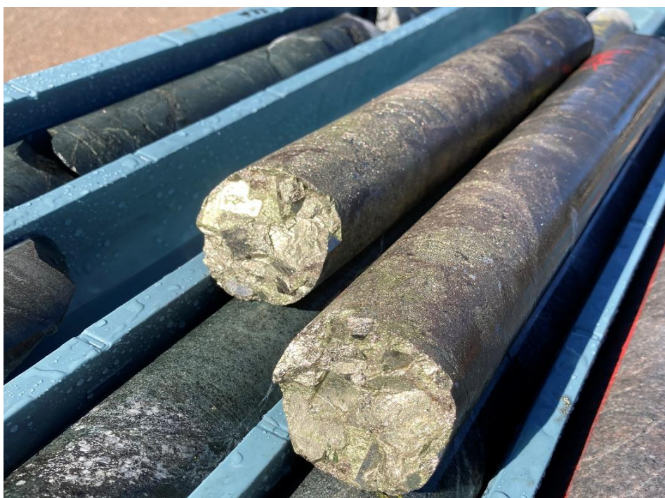
Massive sulphide core from ULG-21-022 prior to assaying