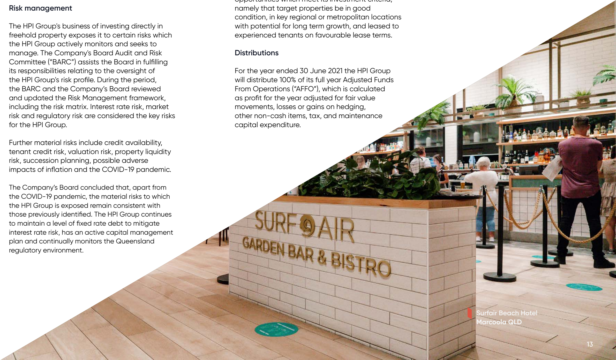
Surfair Beach Hotel Marcolla QLD

PORTFOLIO OF 54 PROPERTIES VALUED AT $952.5M