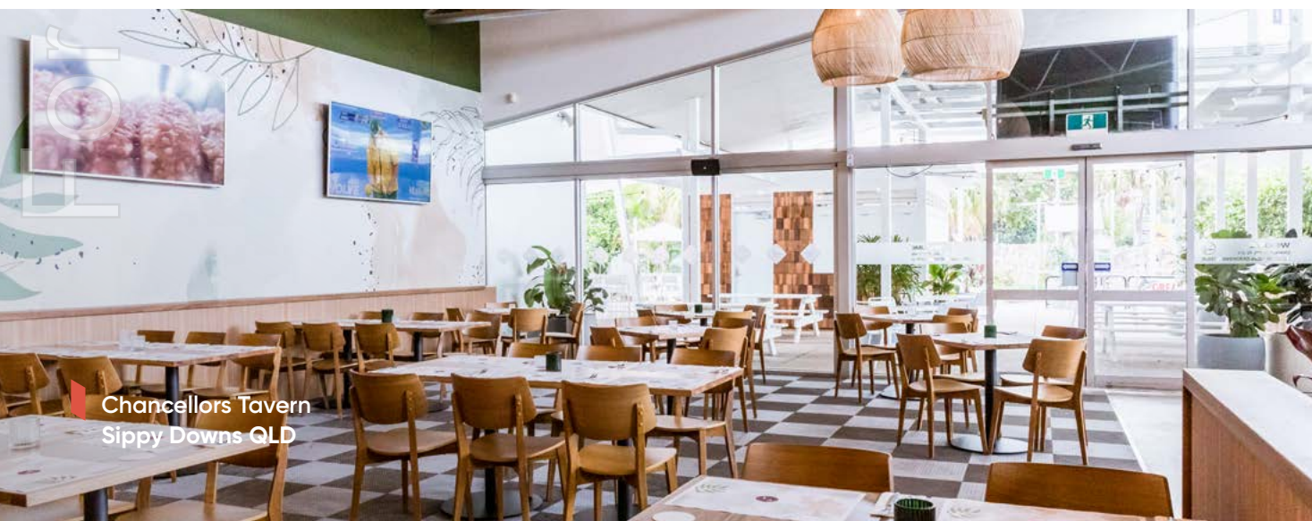
Chancellors Tavern Sippy Downs QLD

The fair values of variable-rate financial assets and liabilities approximate their carrying values.