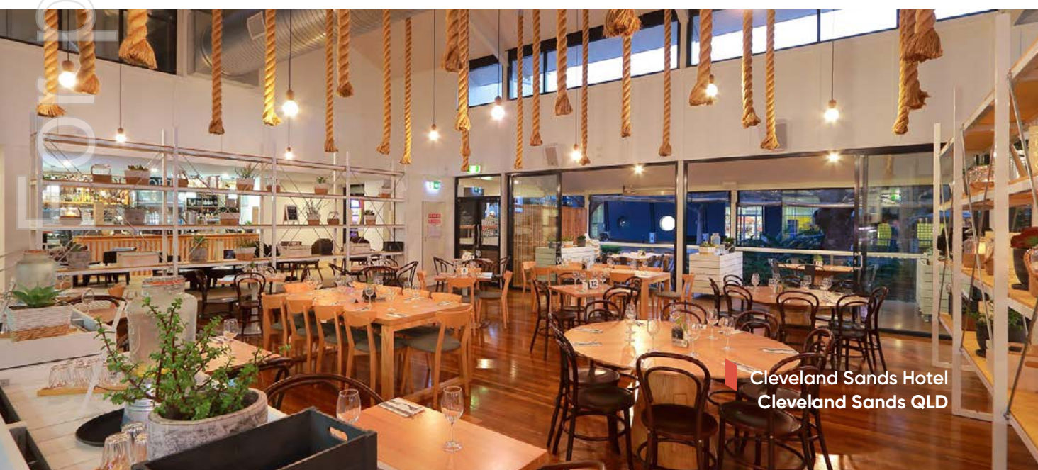
Cleveland Sands Hotel Cleveland Sands QLD

The share-based payments reserve comprises amounts recognised under the long-term incentive plan for executive employees and is the portion of the fair value of the total cost recognised in profit and loss of the unissued securities, which remain conditional on employment with the HPI Group at the relevant vesting date and certain market-based performance hurdles being obtained.