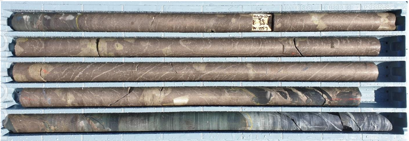
Massive sulphide core from in tray prior to assaying – relates to the 3.7m @ 6.0% Ni portion of ULG-21-030