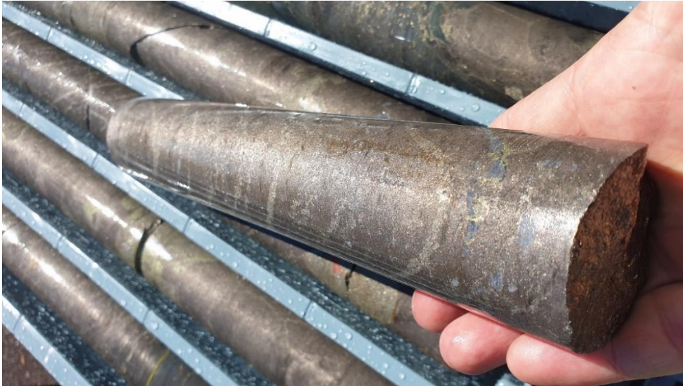
Close-up of massive sulphide core from ULG-21-030 prior to assaying