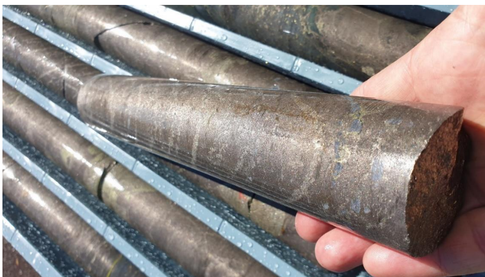
Close-up of massive sulphide core from ULG-21-030 prior to assaying