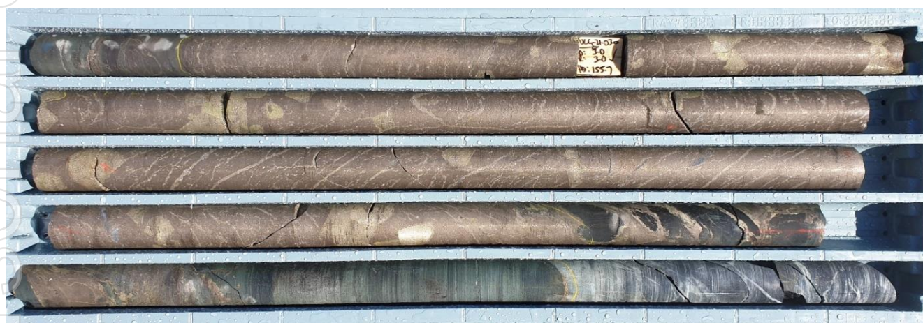
Massive sulphide core from in tray prior to assaying – relates to the 3.7m @ 6.0% Ni portion of ULG-21-030