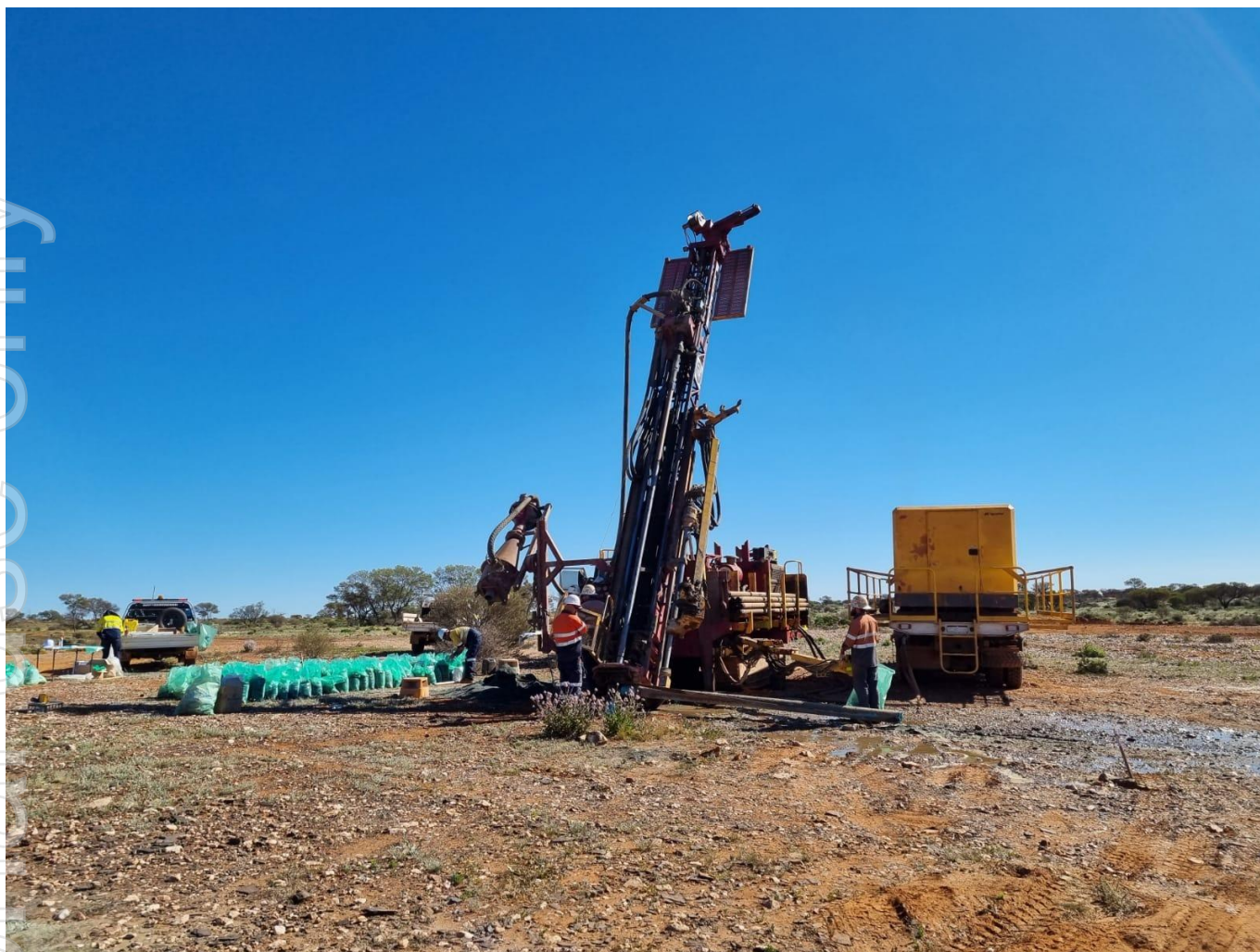
Figure 1: RC Drill Rig at the Austin Gold Project.