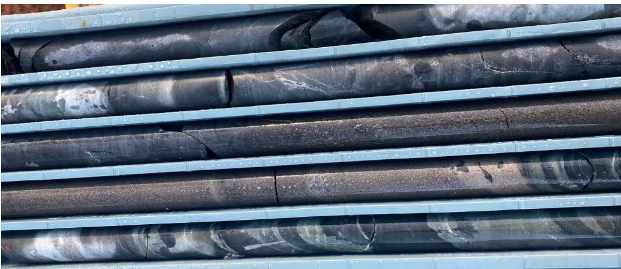
- 0.7m @ 1.9% Ni (off contact, in a hangingwall position) MDD372 intersection (1.2m @ 3.5% Ni) – massive and matrix sulphides in the core tray prior to assays

TEL 08 9476 7200 FAX 08 9321 8994 EMAIL mincor@mincor.com.au WEBSITE www.mincor.com.au ACN 072 745 692