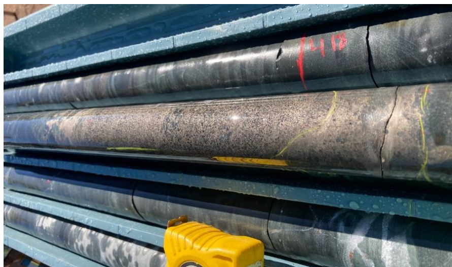
MDD371 intersection (0.8m @ 5.4% Ni) – massive and matrix sulphides