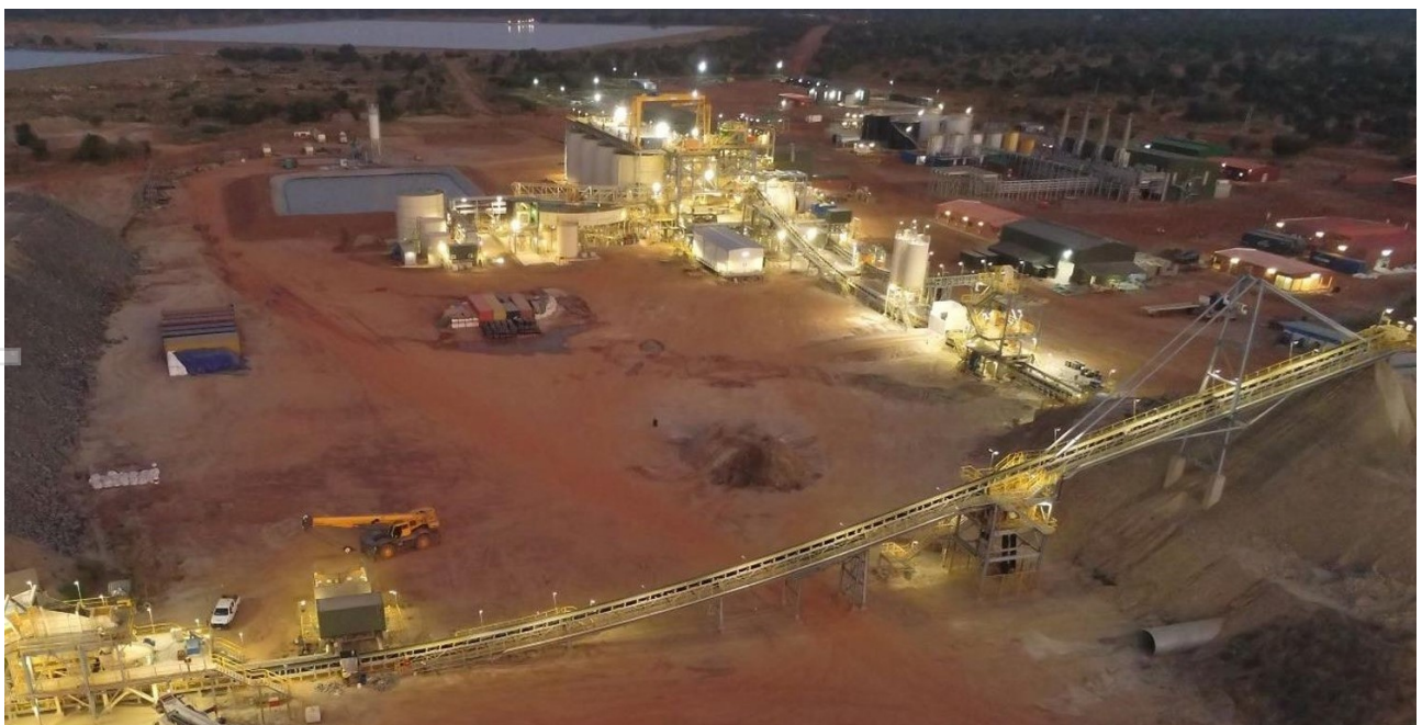
figure 4 – Sanbrado process plant