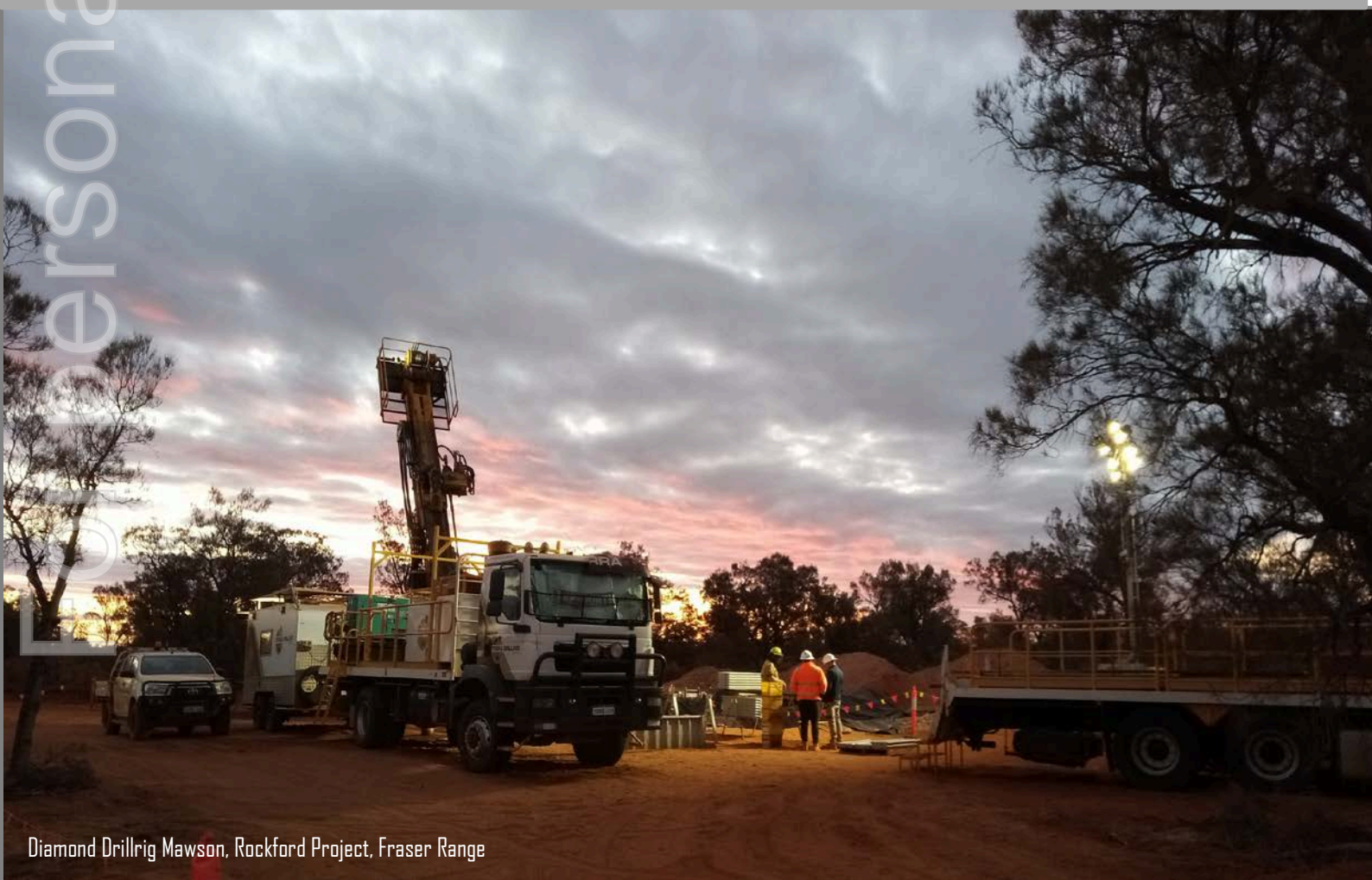
Diamond Drillrig Mawson, Rockford Project, Fraser Range