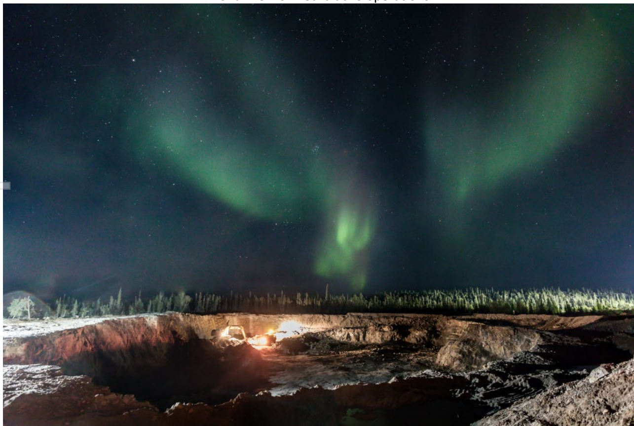
Night Shift operations