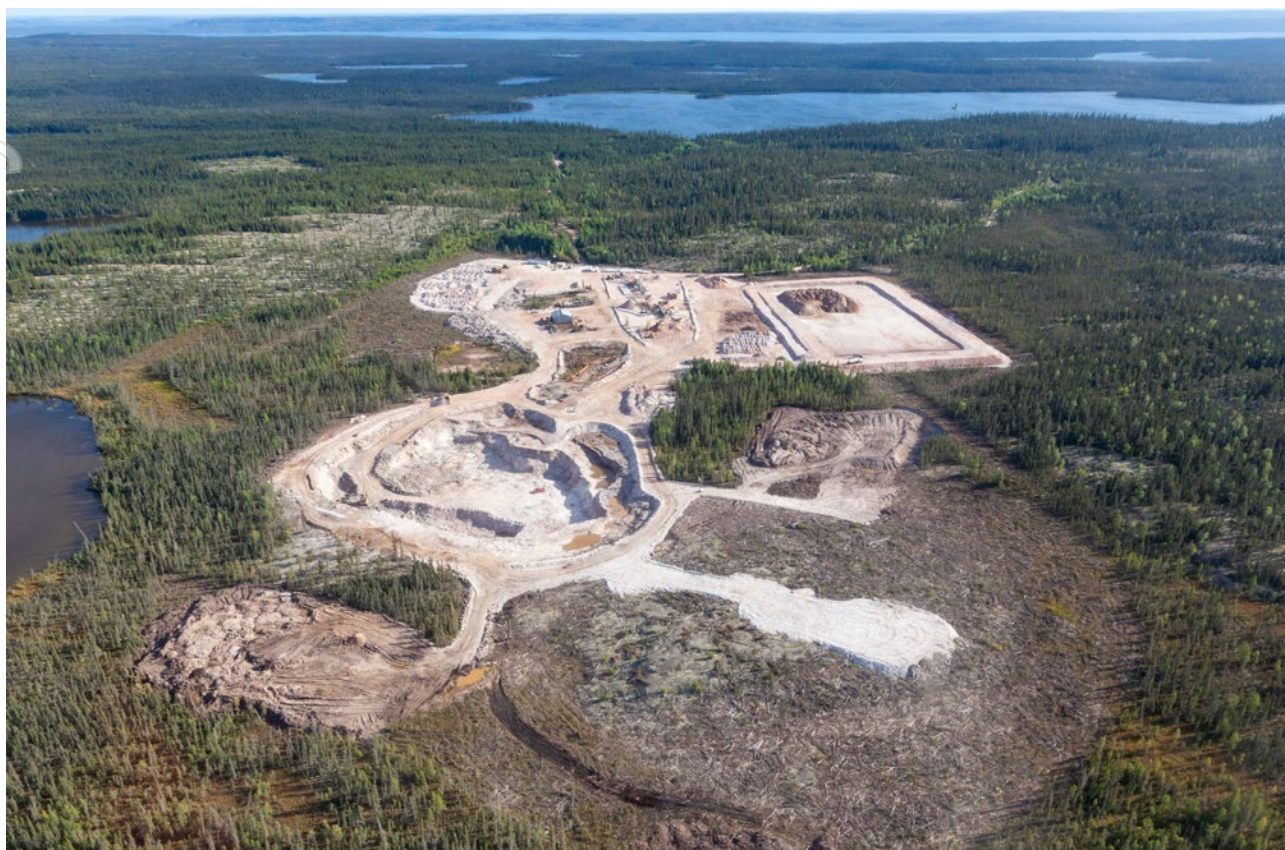
Aerial view of Nechalacho operations