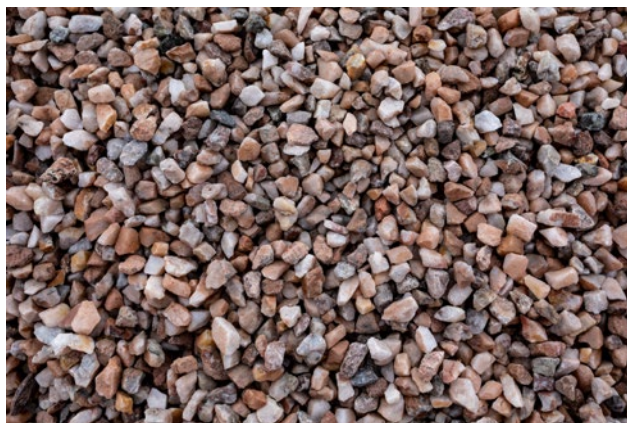
Crushed ore awaiting sorting