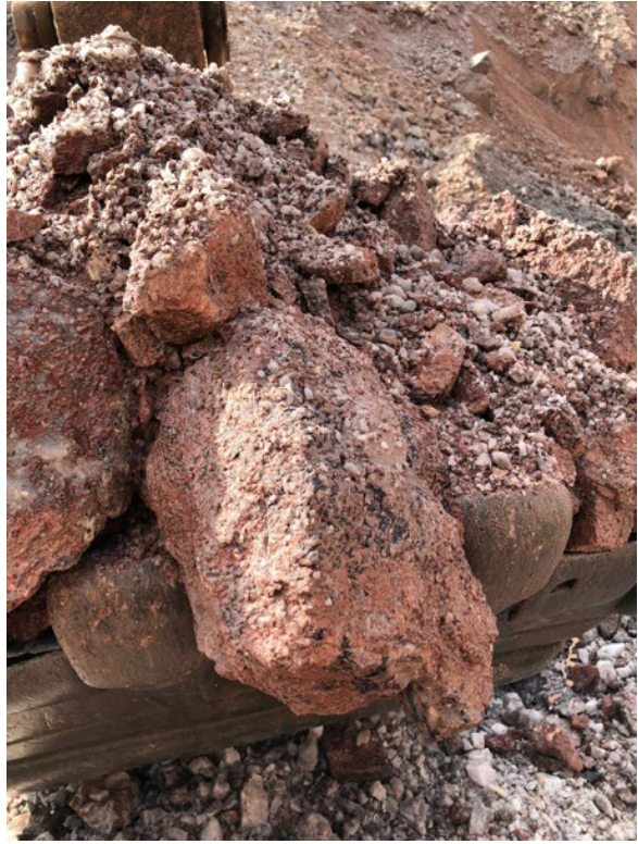
High Grade ore being loaded