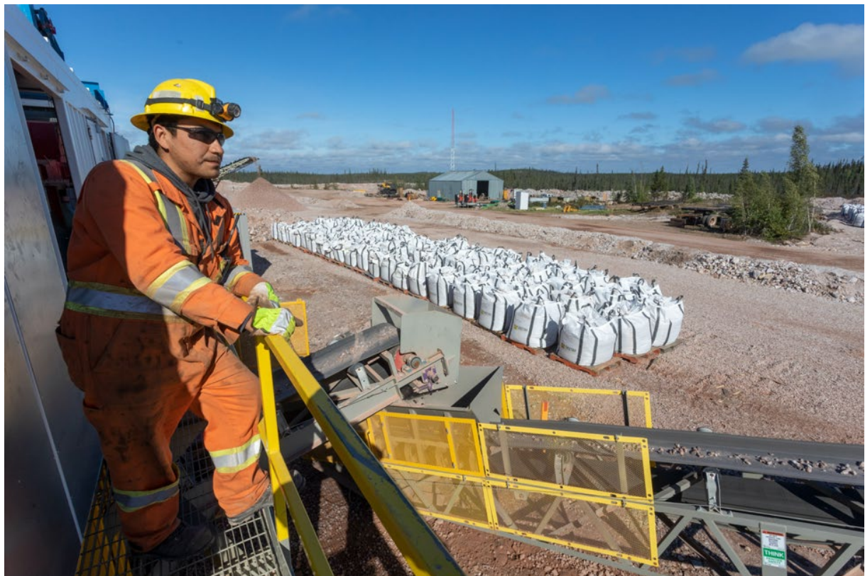
Product staging area at ore sorter reading for relocation to barge lay-down