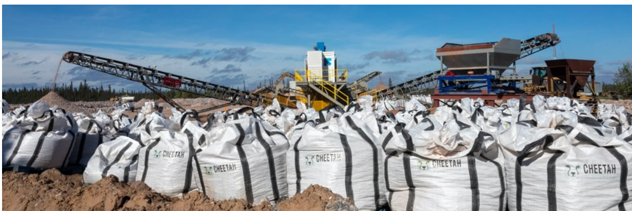
Ore sorter operations ongoing with product bagged