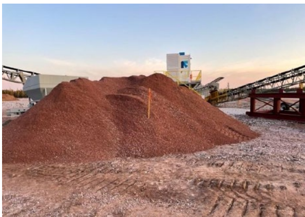
High grade fines ready for bagging