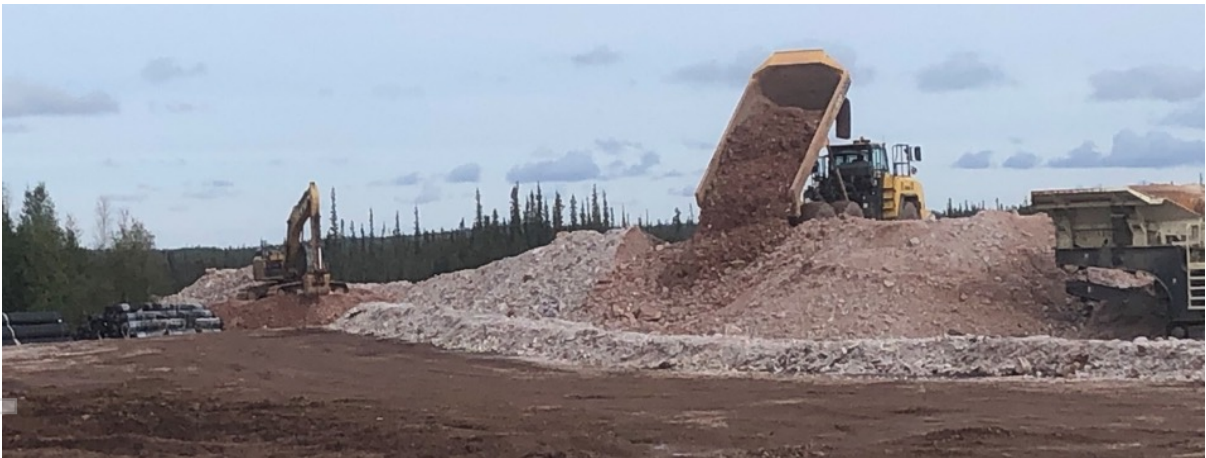
Haul truck placing high-grade ore next to mobile crusher on ROM