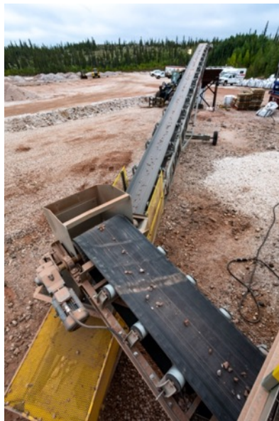
Ore sorter product