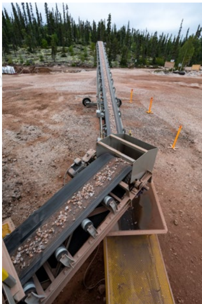
Ore sorter rejects