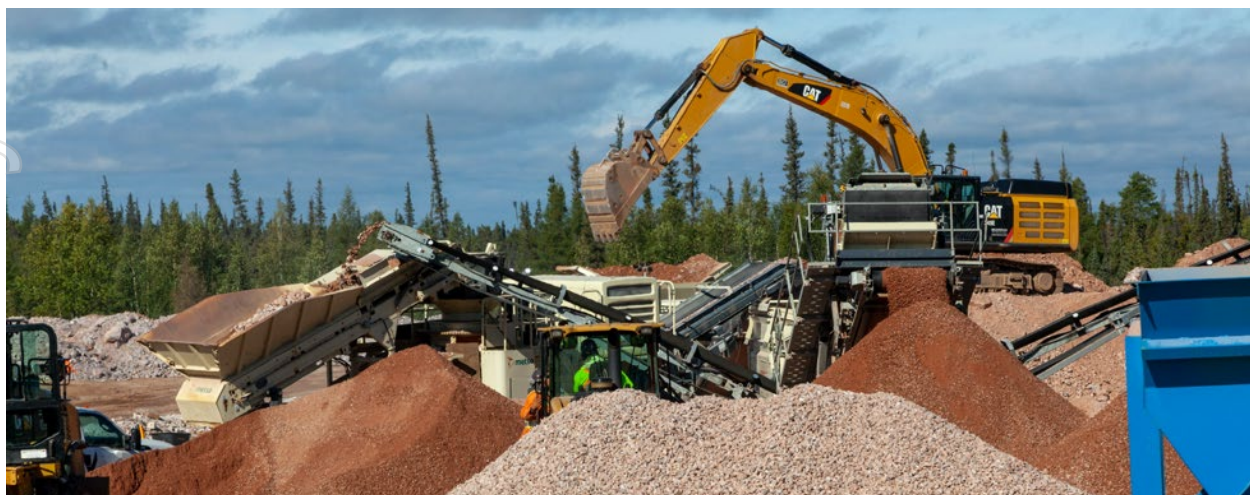
Crushing high grade ore. The red of the bastnaesite is clearly visible