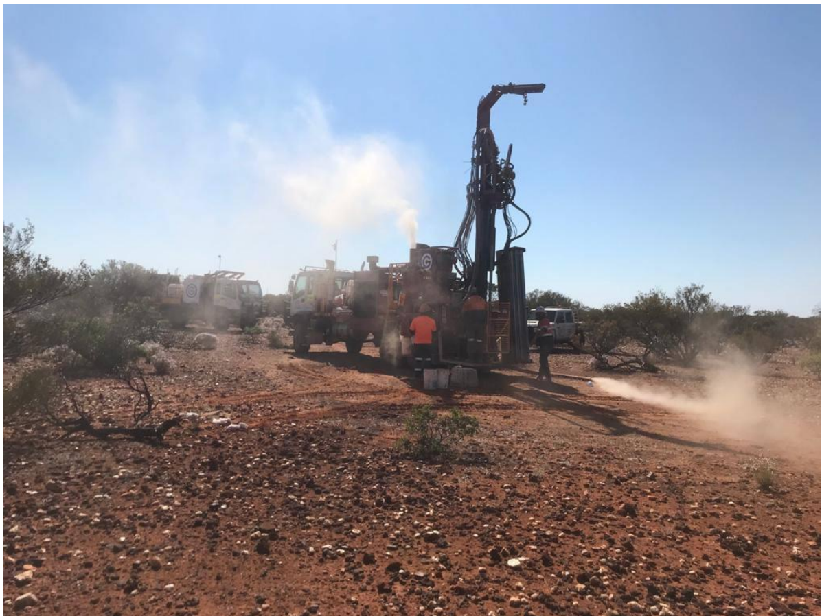
Figure 1: Aircore Drilling Rig at the Shadow Prospect of the Austin Gold Project.

Silver City Minerals Limited (ASX: SCI ) is pleased to announce the commencement and mobilisation of air core drilling at the Shadow target area. The air core drilling program will comprise a total of 4,000 m of drilling and is expected to be completed by late September.