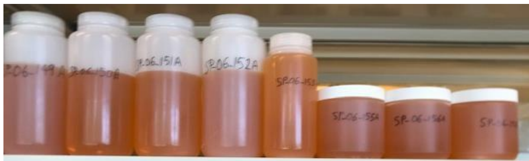
Figure 1: Solution of Supplied Kaolin after Digestion

The MoU was signed with AEM to enable kaolin samples from Andromeda's projects on the Eyre Peninsula to be evaluated using the AEM proven process to determine its suitability for HPA manufacture, and potentially lead to the construction by Andromeda of a HPA plant under a licencing agreement with AEM, which could also include the marketing of HPA manufactured product by ADN through AEM's global distribution network. The MoU was subsequently extended to enable completion of the suitability testing as well as remaining due diligence work.