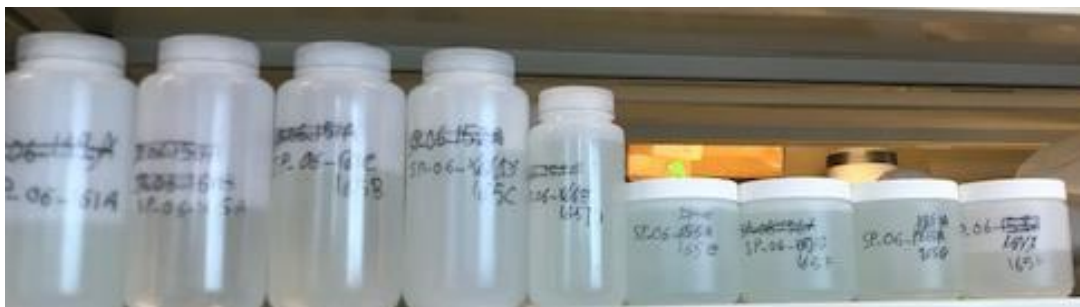
Figure 2: Solution of Supplied Kaolin after Purification