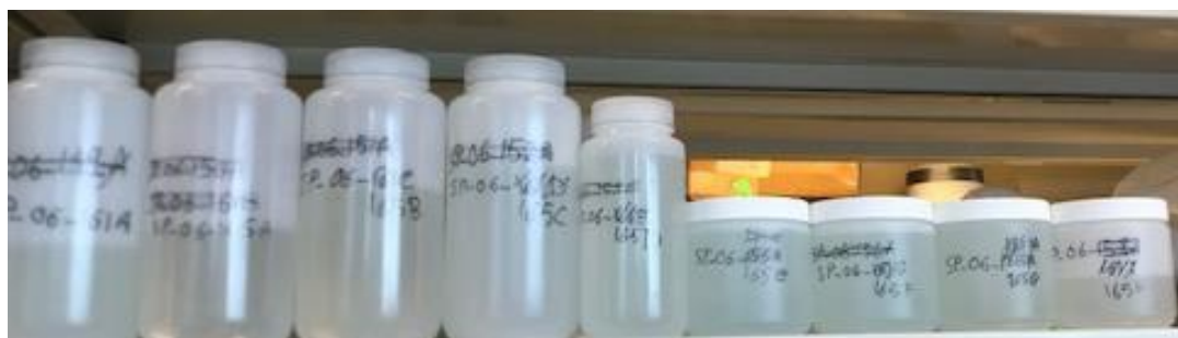
Figure 2: Solution of Supplied Kaolin after Purification