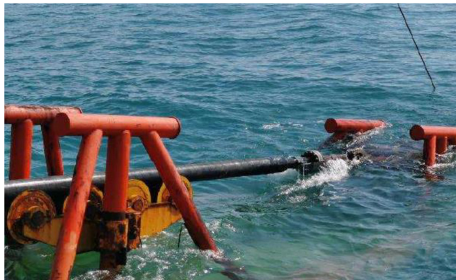
WZ12-8E subsea pipeline laying (August 2021)