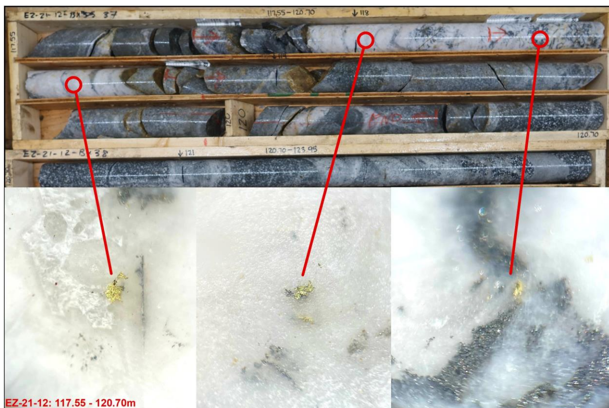
Figure 1 – EZ21-12 Drill Hole Visible Gold

To date, Tempus has completed approximately 8,300 metres of drilling (of the total announced Phase 1 drill program of 12,000 metres) since the program started in November, 2020. In total, Tempus has completed 32 diamond drill-holes at Elizabeth (11 holes completed in 2020, 20 holes completed in 2021 to date). Drill collar information can be seen in Appendix 1, Table 1. There are currently eleven drill holes pending assay results.