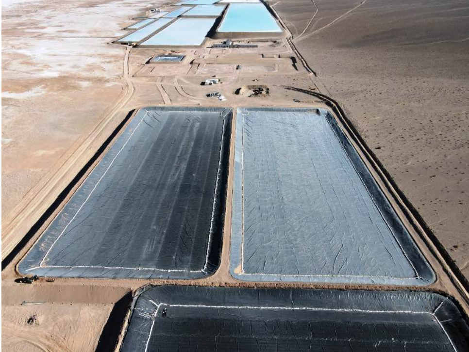
Figure 1. Rincon Lithium Project – 2,000tpa Operation Site Works in Progress

project development expansion. We look forward to a significant near-term growth phase from the increasing development activity at our Rincon Lithium Project."