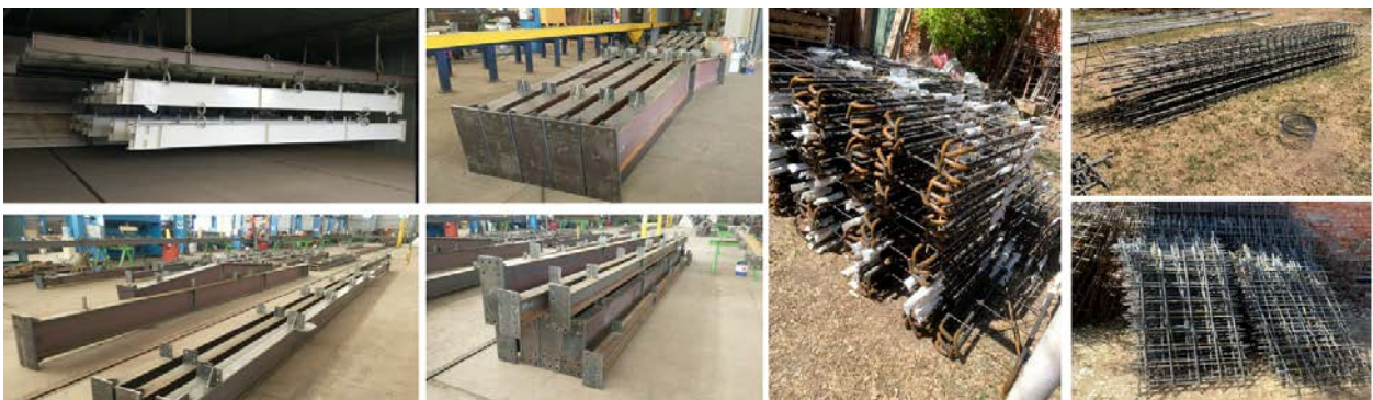
Figure 5. Rincon Lithium Project – 2,000tpa Operation Site Works in Progress (industrial plant advance works)

Further, the major next stage works will focus on plant equipment sourcing and plant warehouse constructions works over coming months. Site works will considerably increase during this time, which will confirm major progress and significant advancement at the project.