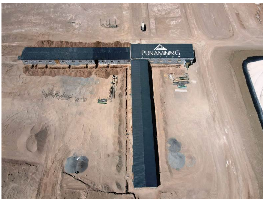
Figure 2. Rincon Lithium Project – 2,000tpa Operation Site Works in Progress (camp construction works)

The construction phase remains on schedule for completion during April 2022, and plant commissioning works, production test-works and ramp-up will follow immediately thereafter. Construction works on the industrial shed housing the 2,000tpa process plant have commenced, and other site works will continue to increase in the coming months.