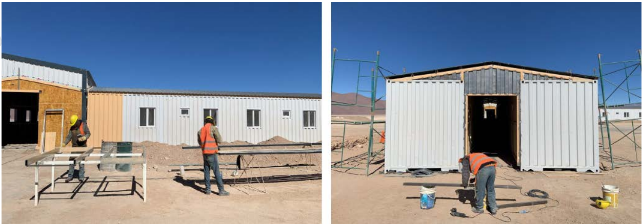
Figure 3. Rincon Lithium Project – 2,000tpa Operation Site Works in Progress (camp construction works)

The brine system works, comprising brine production wells, pumping stations and associated piping, and plant settling ponds, are also progressing toward completion.