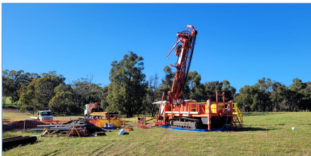
Figure 1. Diamond drill rig in operation at the Sovereign Project, WA. Drilling is designed to understand the geometry and extent of the intrusion at depth including the prospective ultramafic rocks (serpentinite).

The Sovereign Project lies within the highly prospective Julimar Complex (Figure 2) and is located to the north of Chalice Mining Limited’s (ASX: CHN) Julimar Project and south of Caspin Resources Limited’s (ASX: CPN) Yarawindah Brook Project.