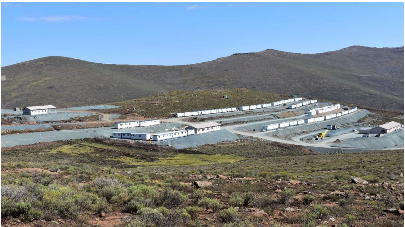
Relocation of new camp and mine offices at Mothae mine in Lesotho

Additional facilities such as a recreation room, gym, training centre and others will be added shortly to improve the wellbeing and comfort of the mine-site team at Mothae.