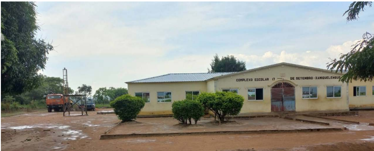
Borehole drilling at the Xamiquelengue Primary School in Angola

In Angola, the Lulo mine undertook borehole drilling, upgraded equipment and built solar power supply in the Xamiquelengue village.