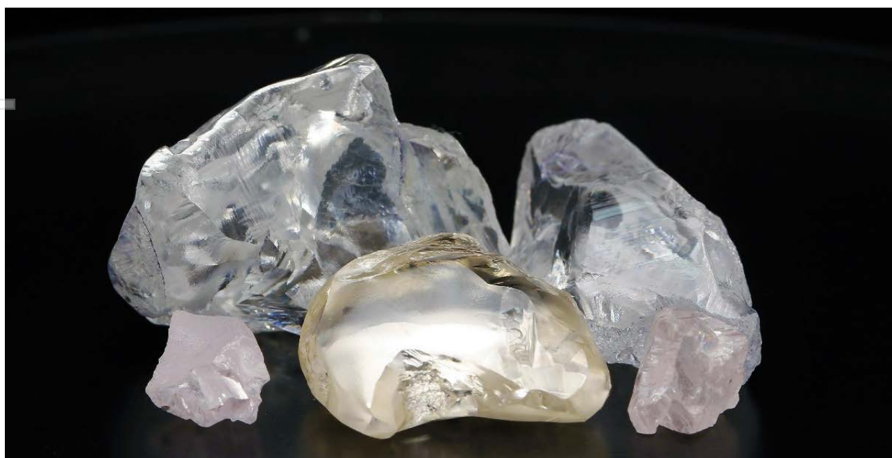
A selection of rough white, pink and yellow diamonds recovered during the quarter

The cutting and polishing partnership continues to deliver additional margins to the mine with many stones awaiting sale or in the manufacturing stage.