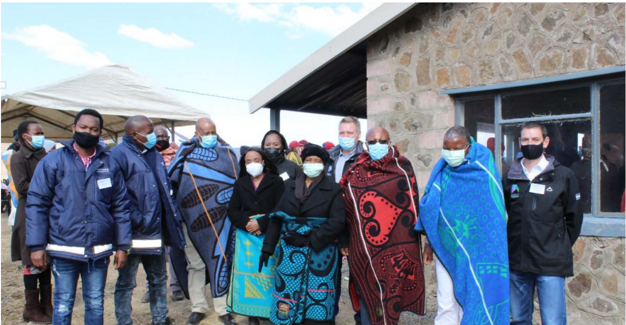
Government of Lesotho Honourable Minister of Mines, Mothae Directors and senior management and school staff at the opening of the refurbished classroom at a primary school in Mapholaneng in Lesotho

The mine also commenced a major upgrade of a primary school in Lesotho, which follows the refurbishment of another nearby primary school by Mothae earlier in the year.