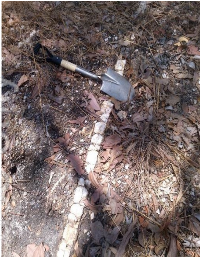
FIGURE 2B: QUARTZ VEINING & TERMITE MOULD – LITCHFIELD LITHIUM PROJECT