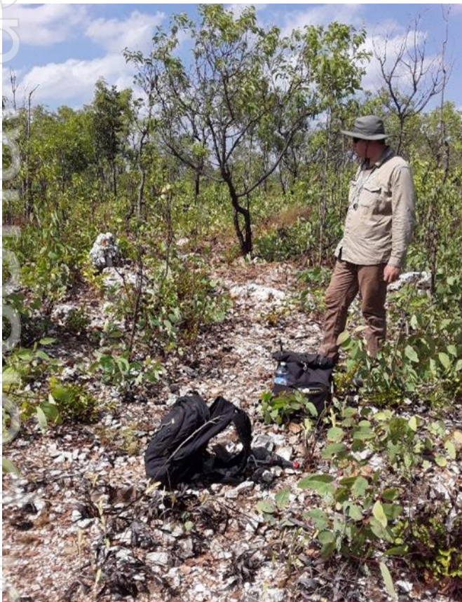
FIGURE 2A: PEGMATITE OUTCROPPING – LITCHFIELD LITHium PROJECT

Leveraging insights from Stage 1, coupled with historical reports, Stage 2 comprised soil sampling across four grids – 400m spacing by 100m intervals – within four zones on the western boundary contiguous to CXO's Mt Finnis Lithium Project. Overall, 501 samples were collected from any outcrop, float or termite mounds found to be of significant size or interest (similar to Figure 2A and 2B below).