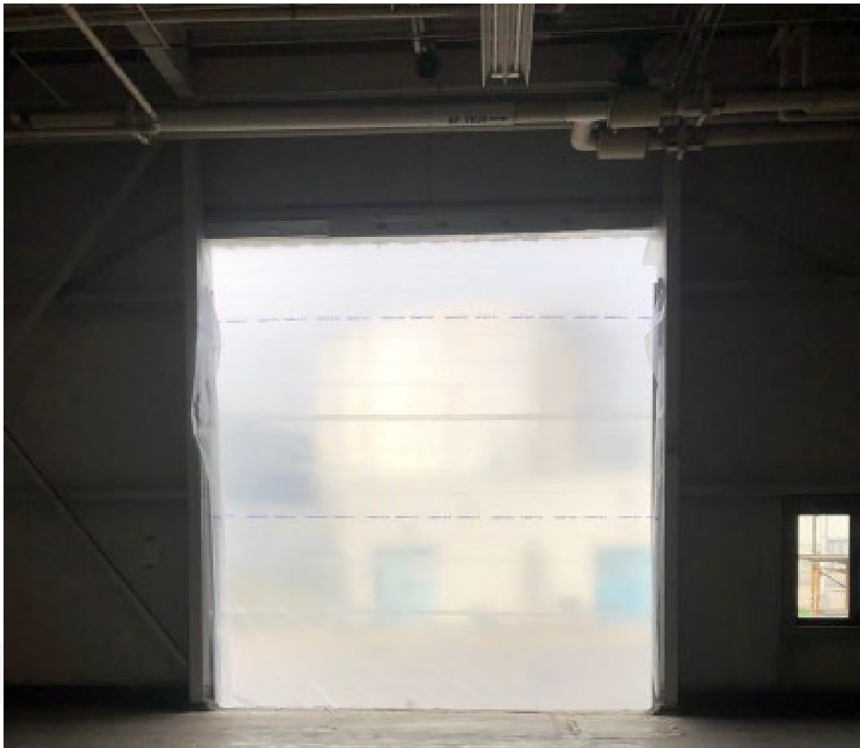
Figure 3: Opening made for De-humidifiers to be bought into the factory