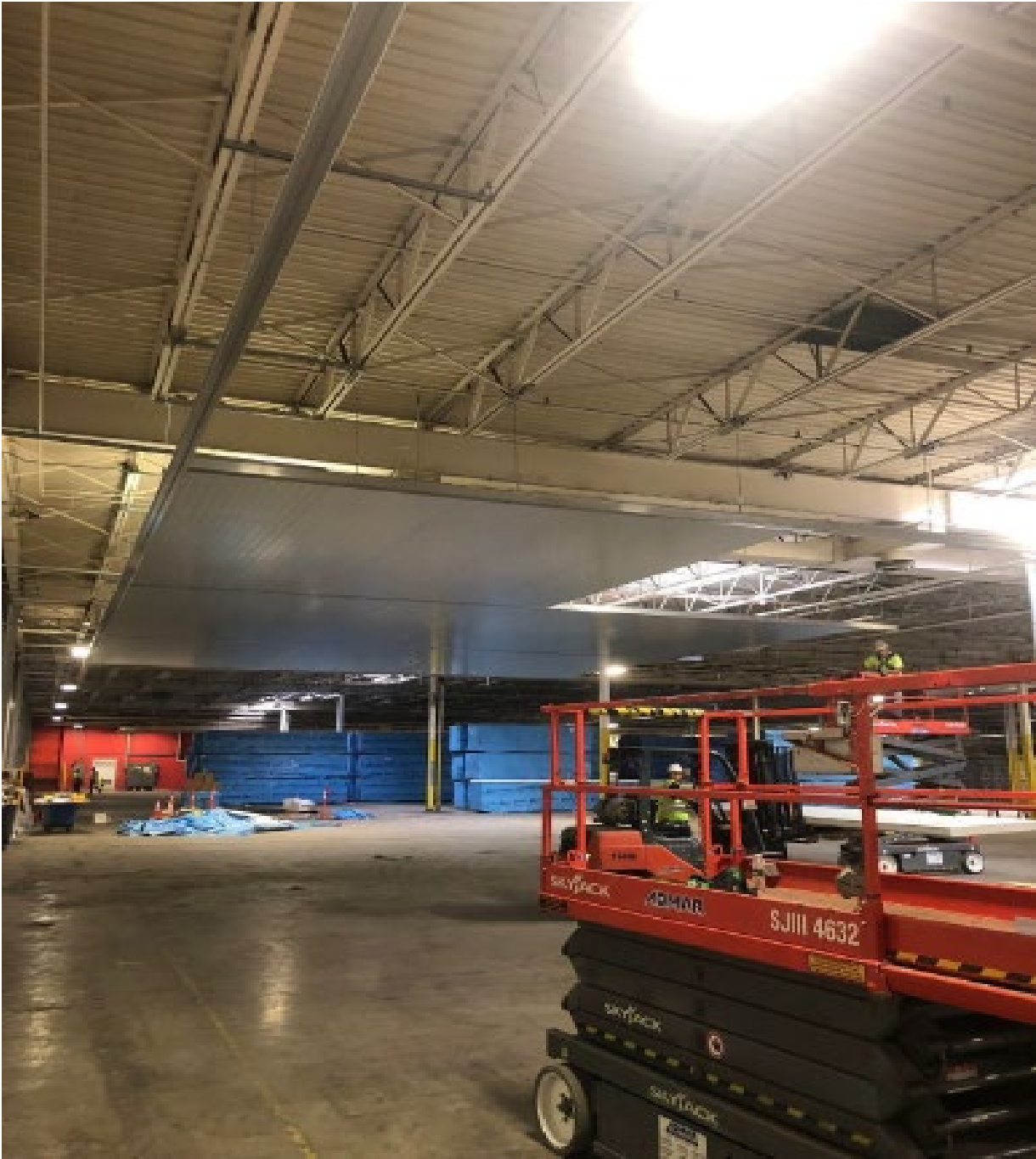
Figure 2: Dry Room Ceiling Plenum being installed