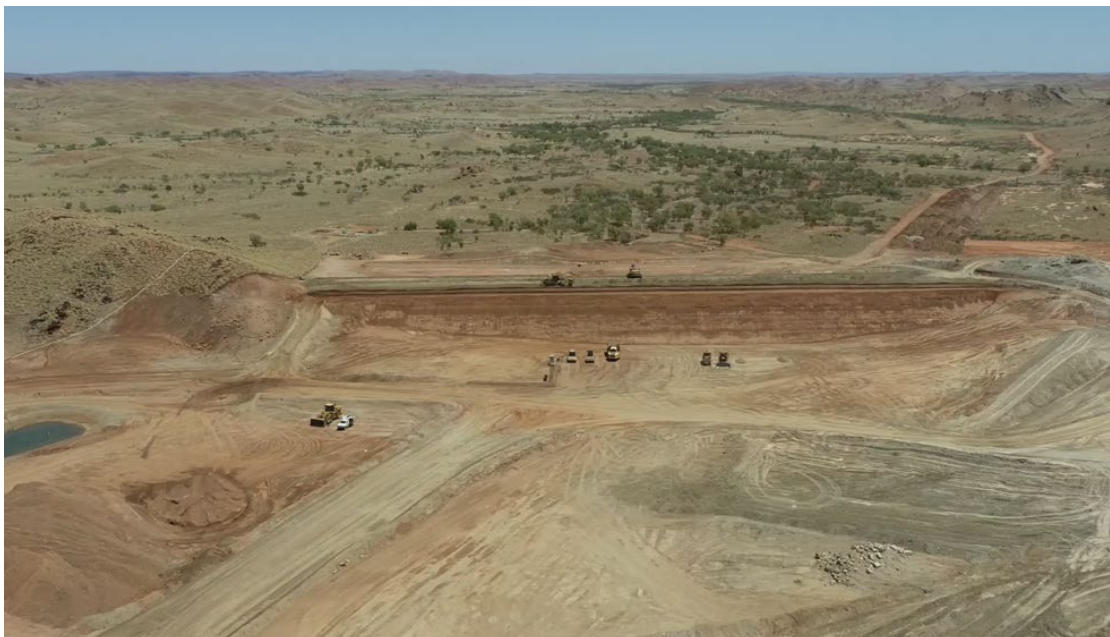
Figure 4: Tailings Dam