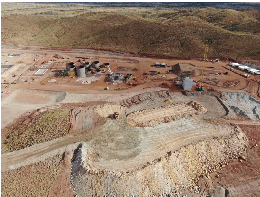
Figure 5: First ore on ROM Pad