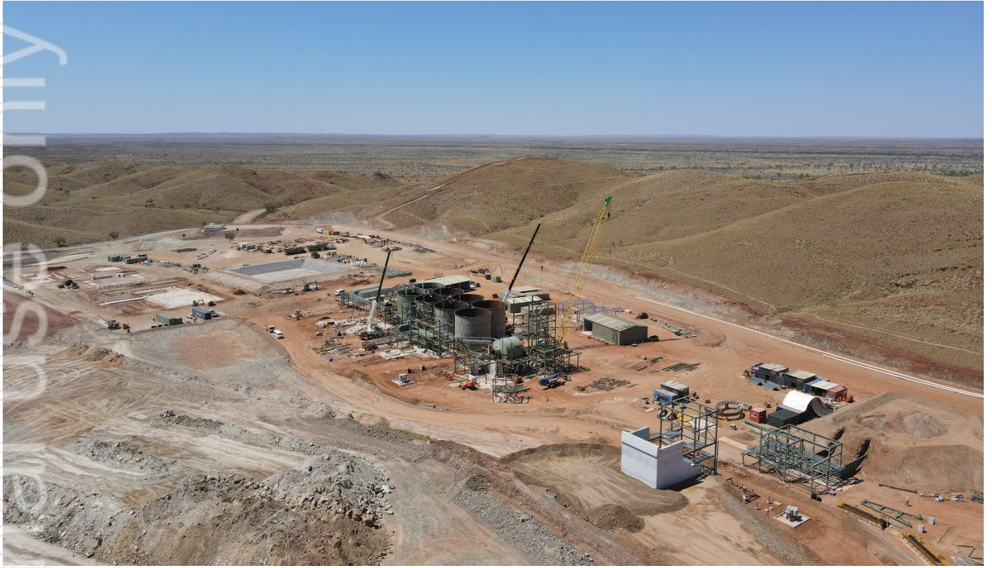
Figure 1: Overall Site View