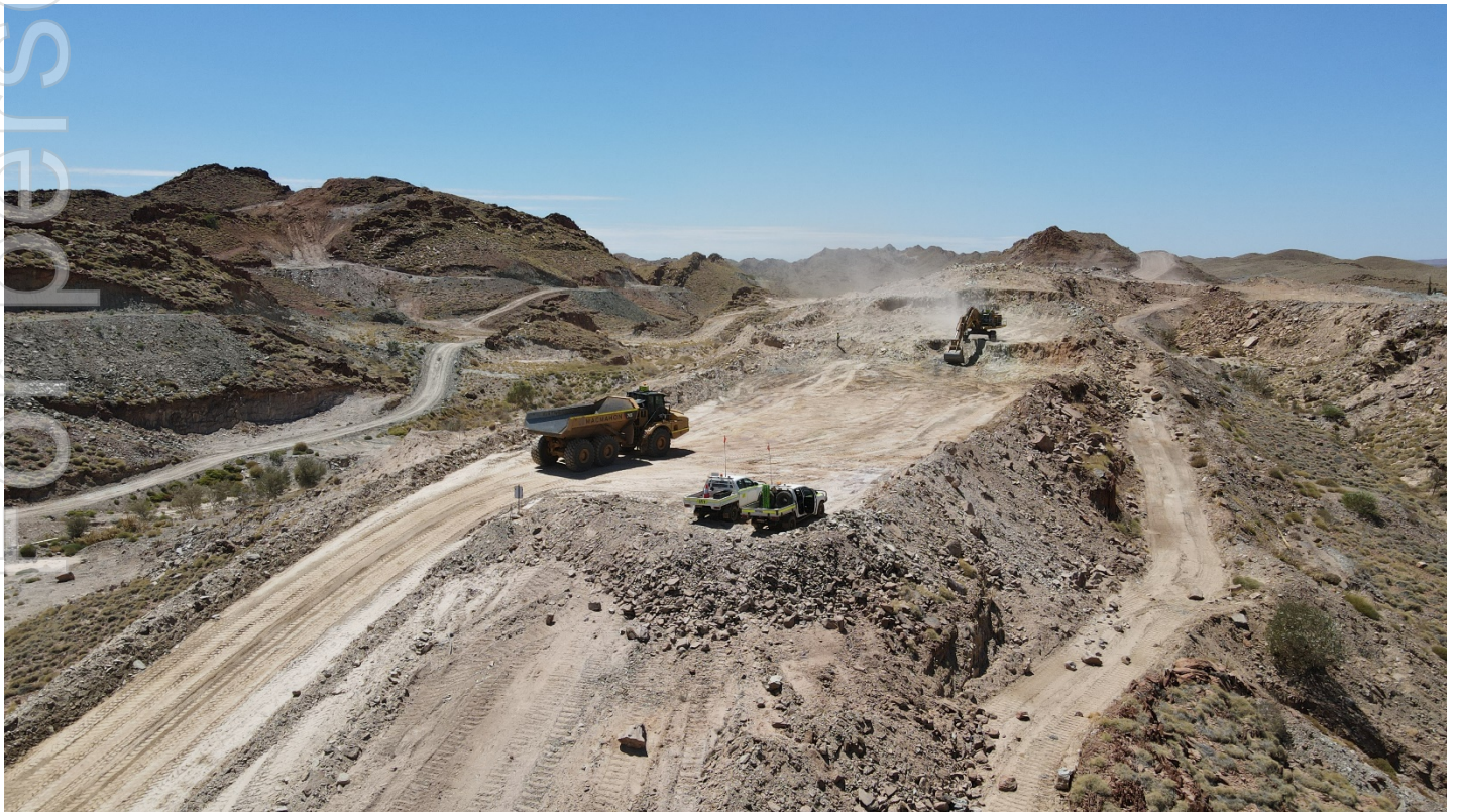
Figure 7: Mining Operations