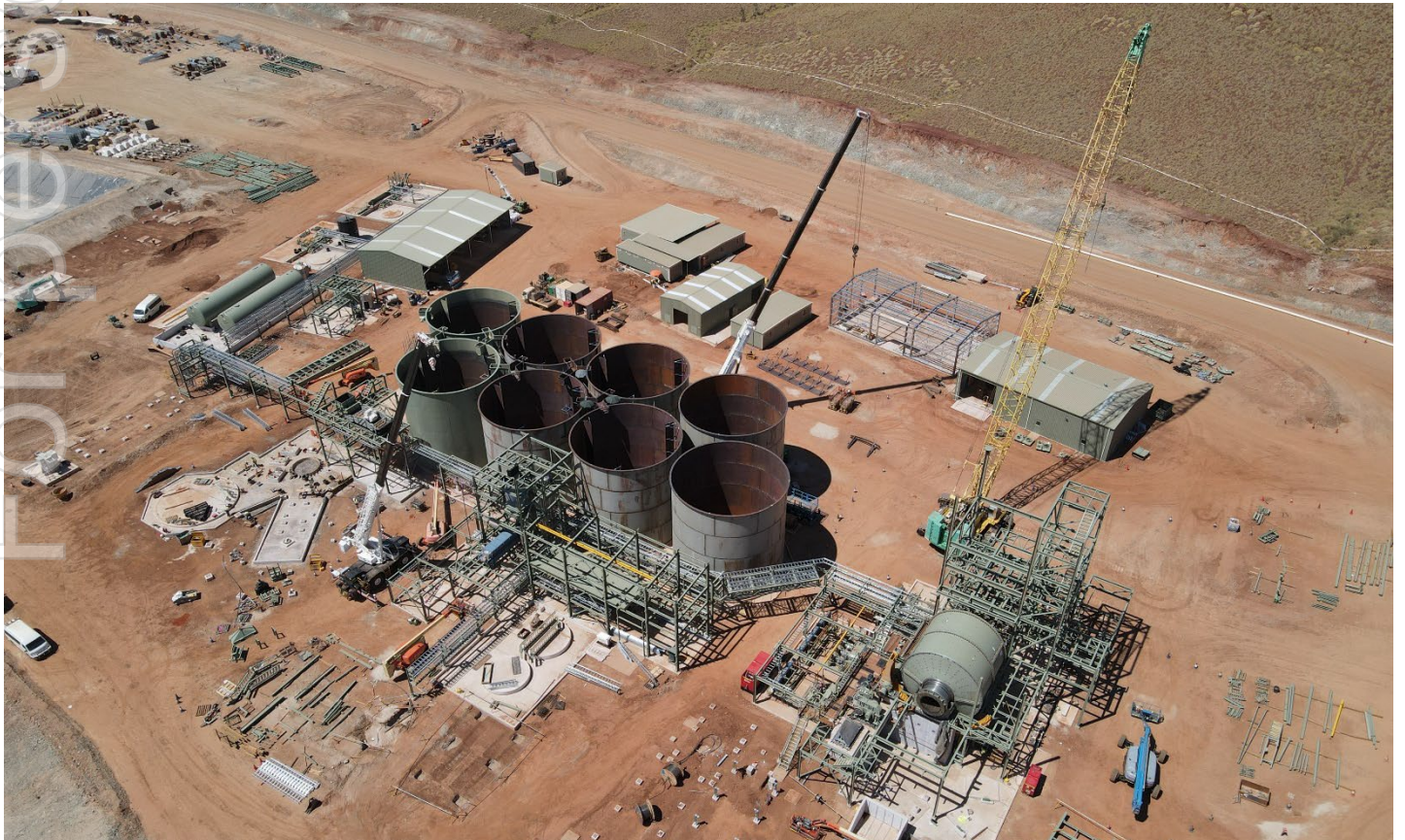
Figure 2: Mill and CIL tank area