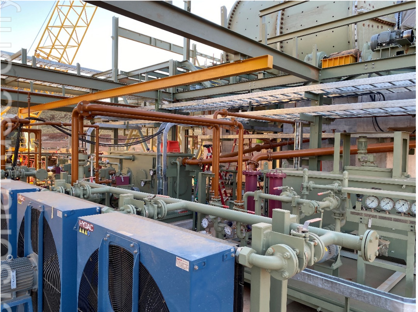
Figure 3: Mill Lubrication System installed