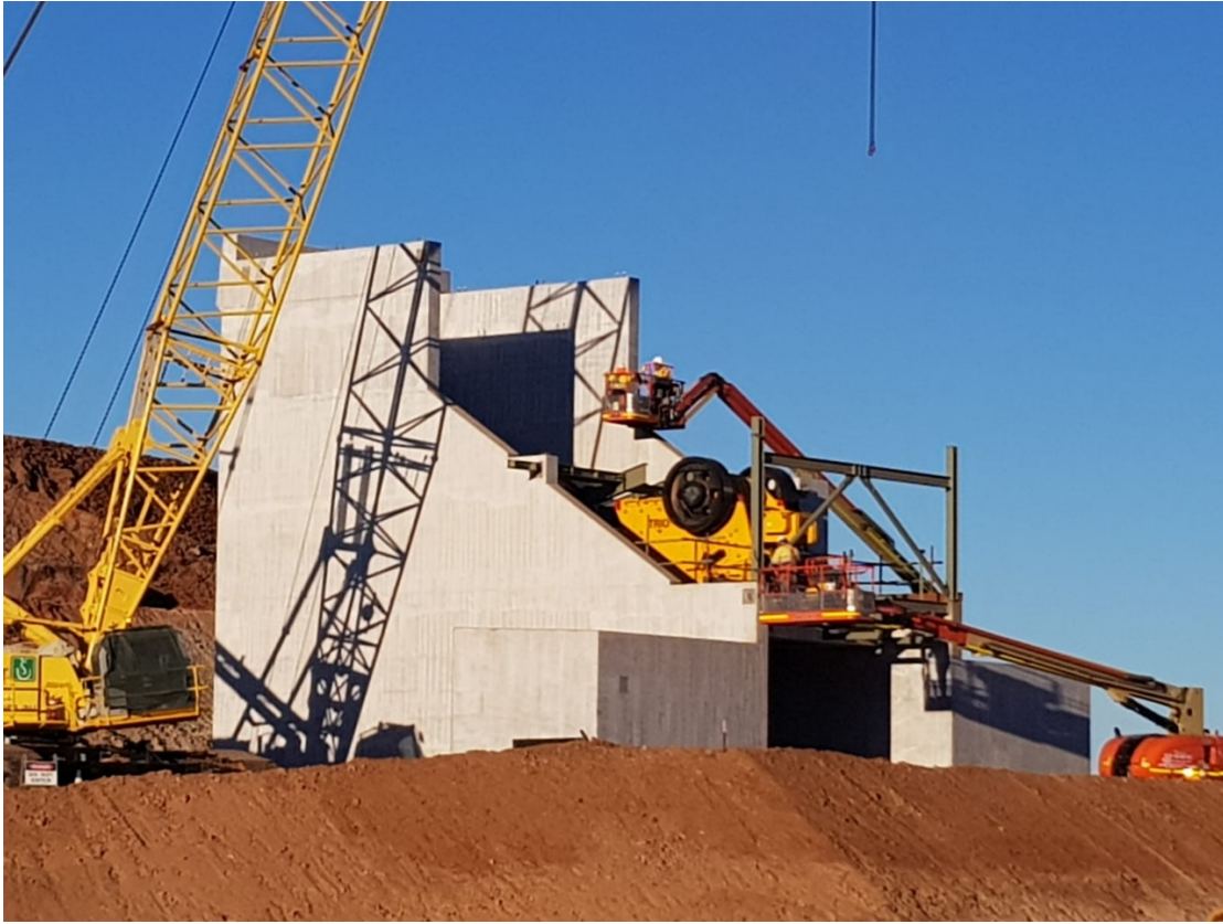
Figure 6: Crusher Installed