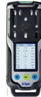
Draeger portable hydrogen meter