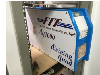
Wellsite hydrogen sample system