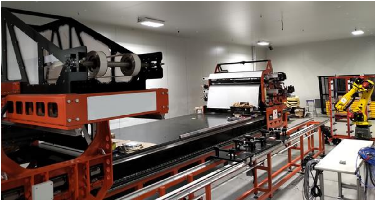
Above image: Production click press now on site.

The delivery of the first production cutting press machine was a significant industrialisation milestone during the quarter. The production-scale machine is expected to be a big step forward in the efficiency of our ply cutting technology. The machine was developed with a local equipment partner and follows from the significant learnings derived from the earlier prototype cutting presses. This press is now being commissioned ahead of the introduction of it to new programs.