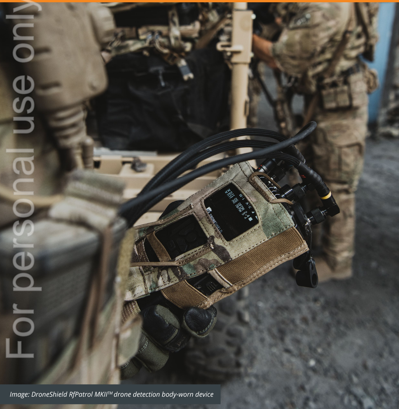
Image: DroneShield RfPatrol MKII™ drone detection body-worn device