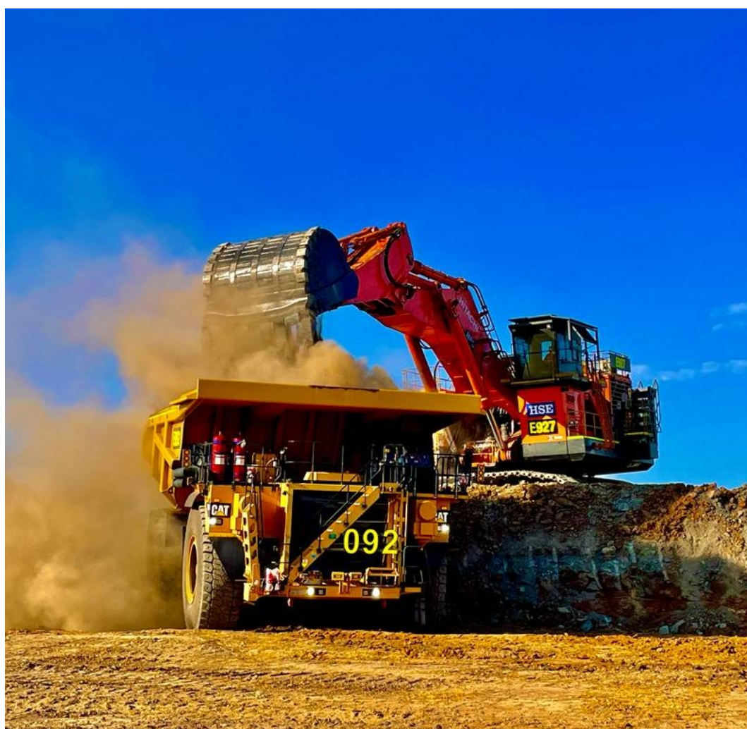
Figure 3: A Hitachi Ex3600 excavator matched with CAT789 trucks has commenced work

As previously announced, contracts are in place for the underground mining operations scheduled for commencement in the second half of 2022.