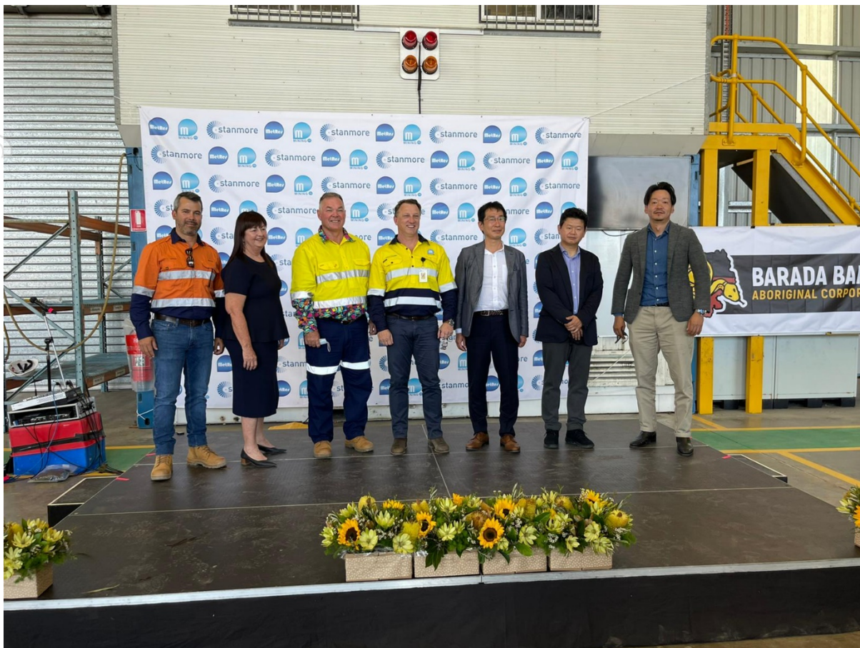
Figure 4: Opening day at Millennium and Mavis Downs mine