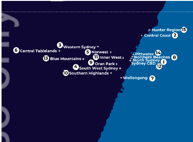
NSW Existing Locations: 15