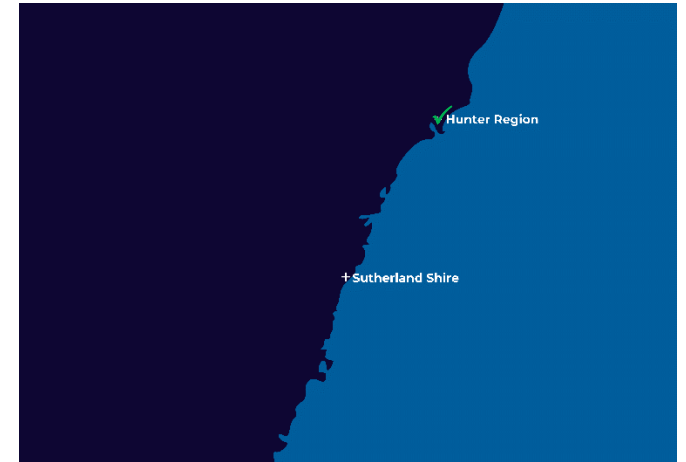
NSW Target Marquee Locations: 2 (completed: 1)