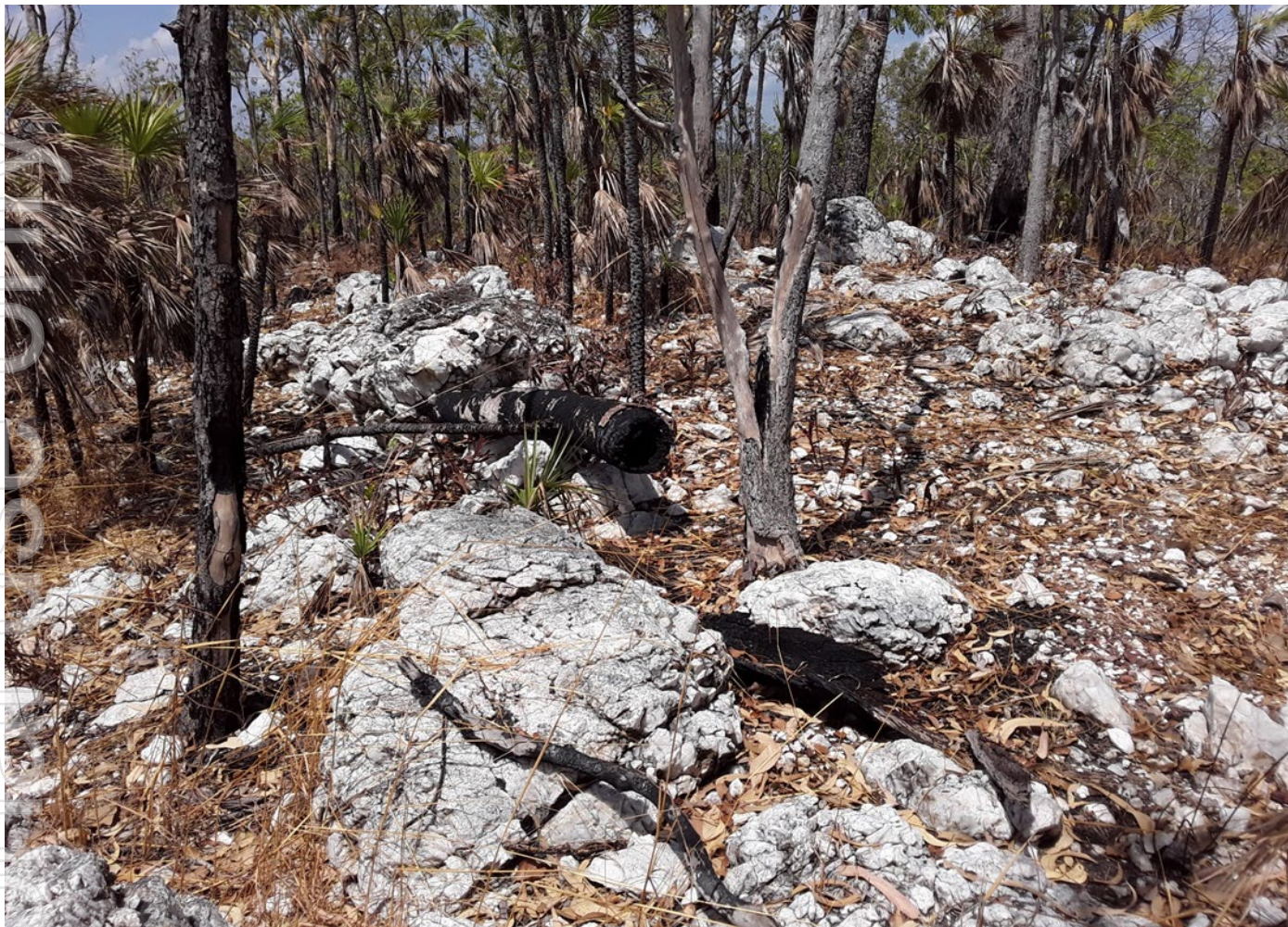
FIGURE 3: PEGMATITE OUTCROPPING – LITCHFIELD LITHIUM PROJECT

Location: mE 698222 mN 8600701