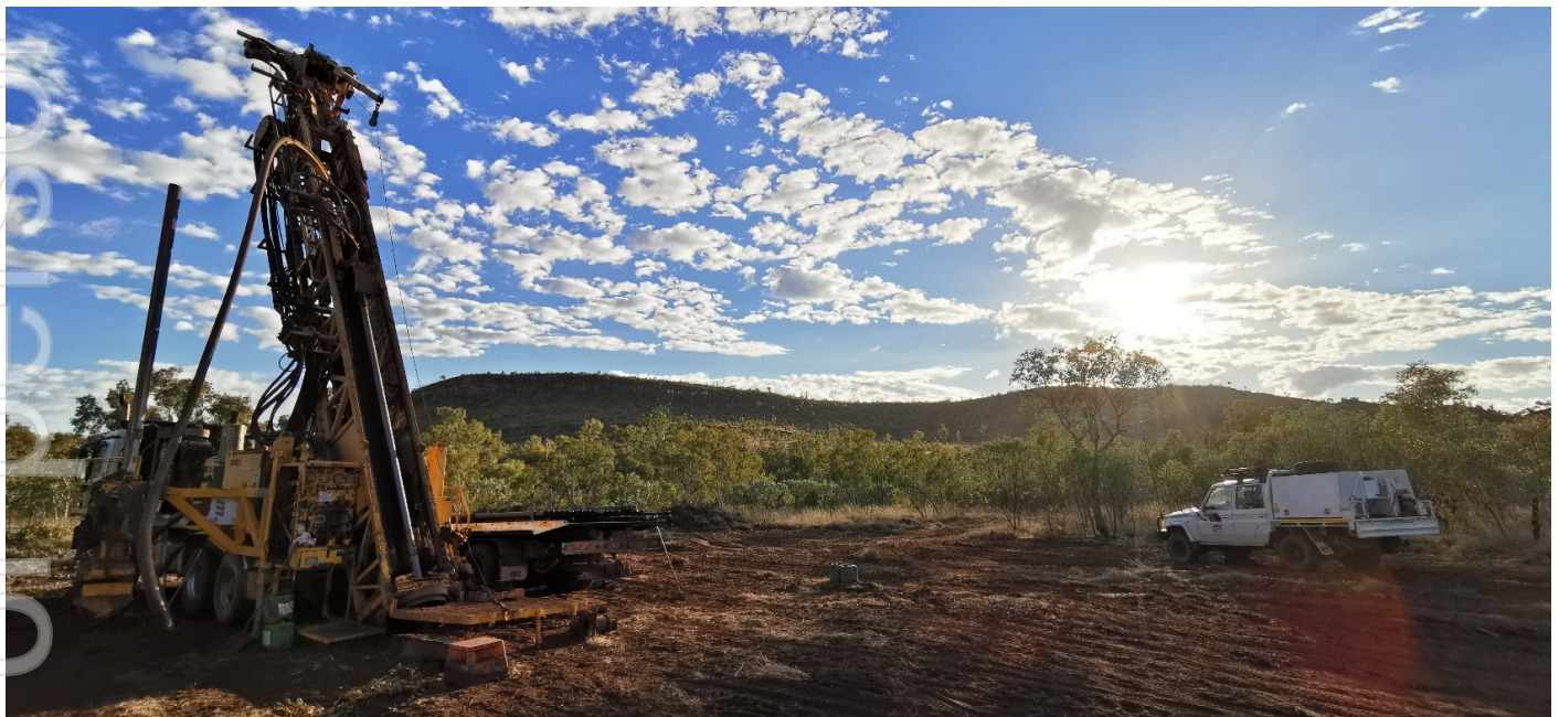
FIGURE 1: DRILL RIG AT BIG ONE DEPOSIT

A key feature behind the success of the current campaign (Figure 1) has been the significantly improved targeting, resulting from the effective utilisation of geophysical insights to refine and reshape the drilling program to boost the collective exploration potential 1 .