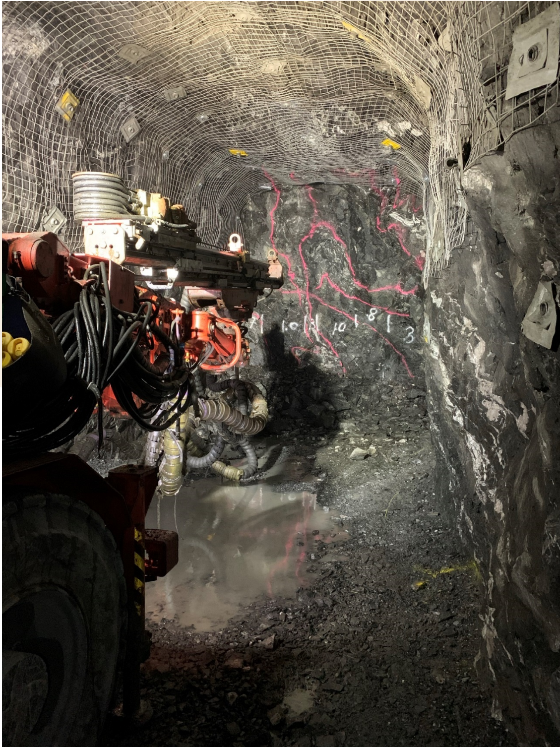
Ore drive underground at Golden Eagle

The Company is currently conducting work at both Makai and Riverina to assess the opportunity to add further underground production to our mine schedule. Makai is located adjacent to the historic Lights of Israel mine and less than 1km from the Davyhurst plant.