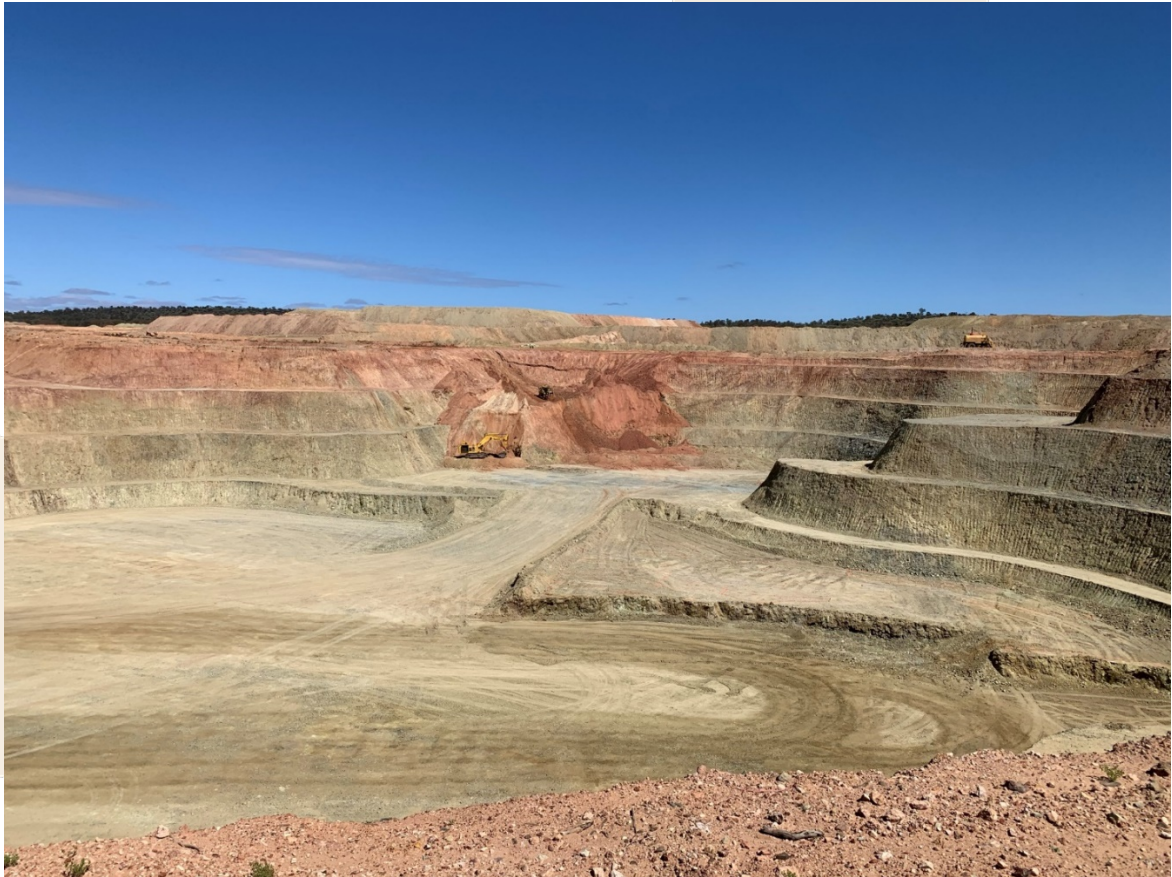
Riverina open pit (looking west) showing rehabilitation work of slip underway.