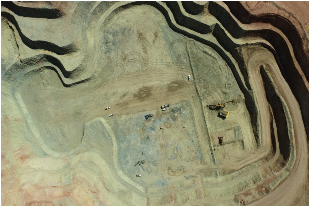
Riverina open pit (northern end).