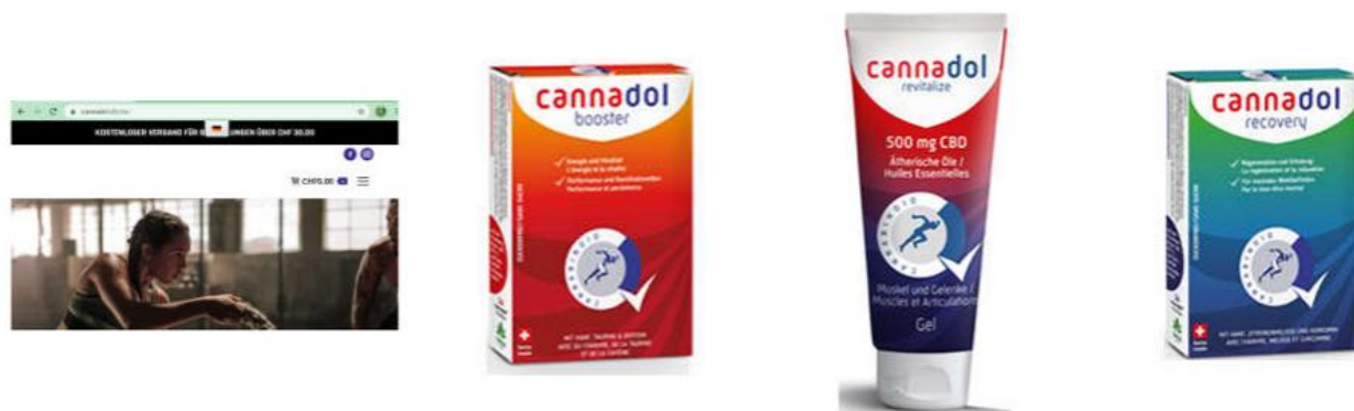
Image: Creso Pharma's new e-commerce channel and 'Born to move' range

across major wholesalers in Switzerland with the Company's reach extending to over 2,100 points of sale including pharmacies, pharmacy networks, drugstores and over 400 sport & fitness centres. Further distribution into the sports markets in additional European countries are being established with Poland and Portugal earmarked for near term expansion.