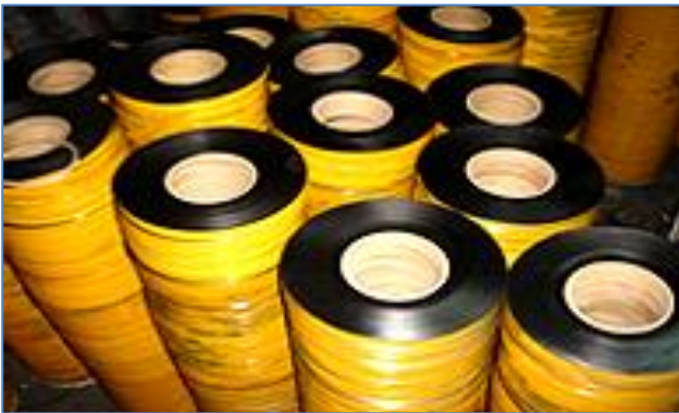
Flexible Graphite Tape