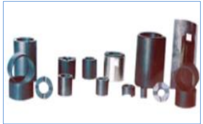
High Purified Graphite Products