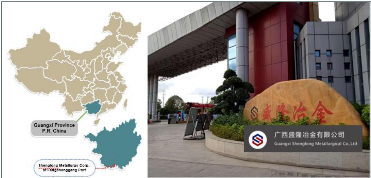
Figure 2 – Shenglong Metallurgy Co. Ltd Location

Metallurgy and other potential steel mill clients in China about the opportunity presented by AVL's FeTi coproduct. This first LOI demonstrates the marketability for AVL's FeTi coproduct among the steel makers. Work is actively progressing on additional LOIs which will lead to binding agreements. This agreement further validates AVL's strategic decision to locate the vanadium processing plant close to Geraldton's port, strengthening the AVL pathway to funding and project development."