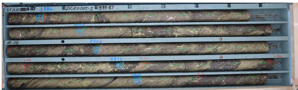
Figure 1: Hole 21CRD005-2 core (884m-888m downhole) displaying heavily mineralised zone

“We continue to see these fantastic widths of high grade copper accompanied by a gold credit within the upper section of the IOCG body at Jupiter Deeps. Again, some sections have assayed in the 4% and 5% range within the overall intercept. All holes drilled into Jupiter and Jupiter Deeps orebodies this year have expanded the dimensions of the mineralised system with 21CRD005-2B and 21CRD005-3 being last holes of the 2021 resource definition program at Rover 1 with assays pending. Castile looks forward to updating the market with a revised resource estimate including these new areas of mineralisation, and we anticipate that the strong drilling results obtained during 2021 will lead to a superior commercial outcome when incorporated into mining studies”.