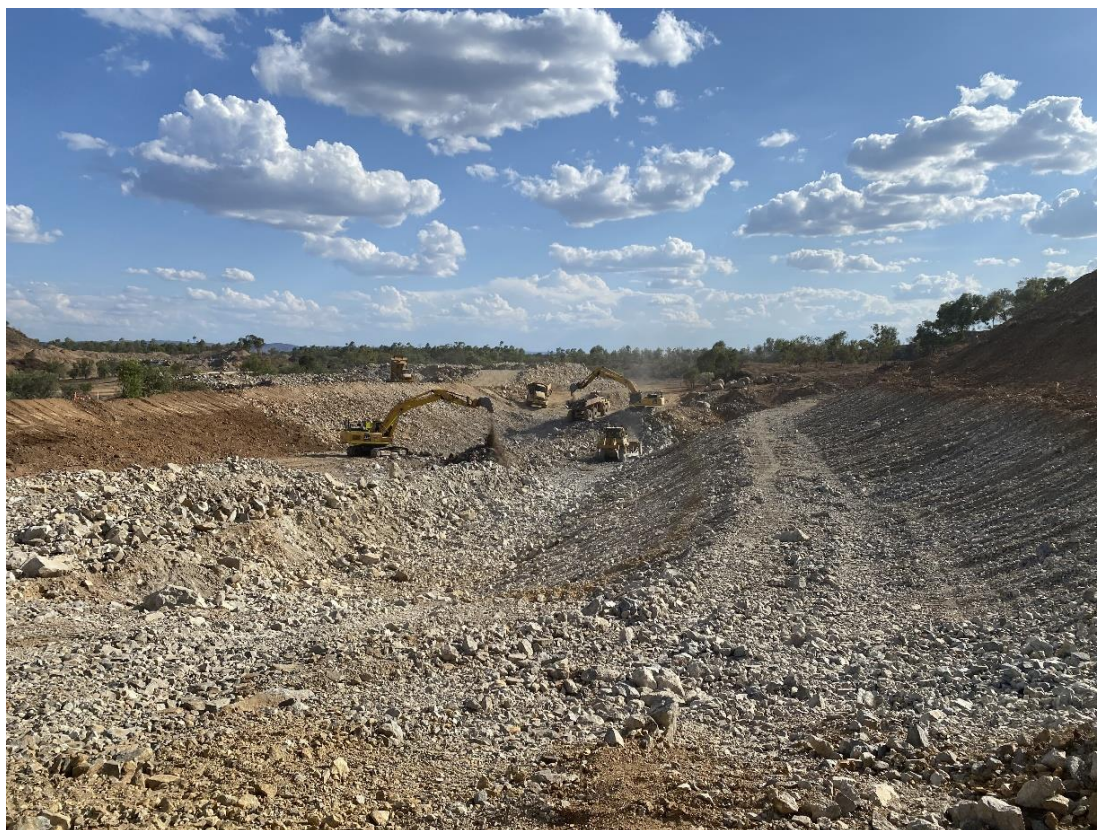
Figure 3: Wises Dam - Embankment Works