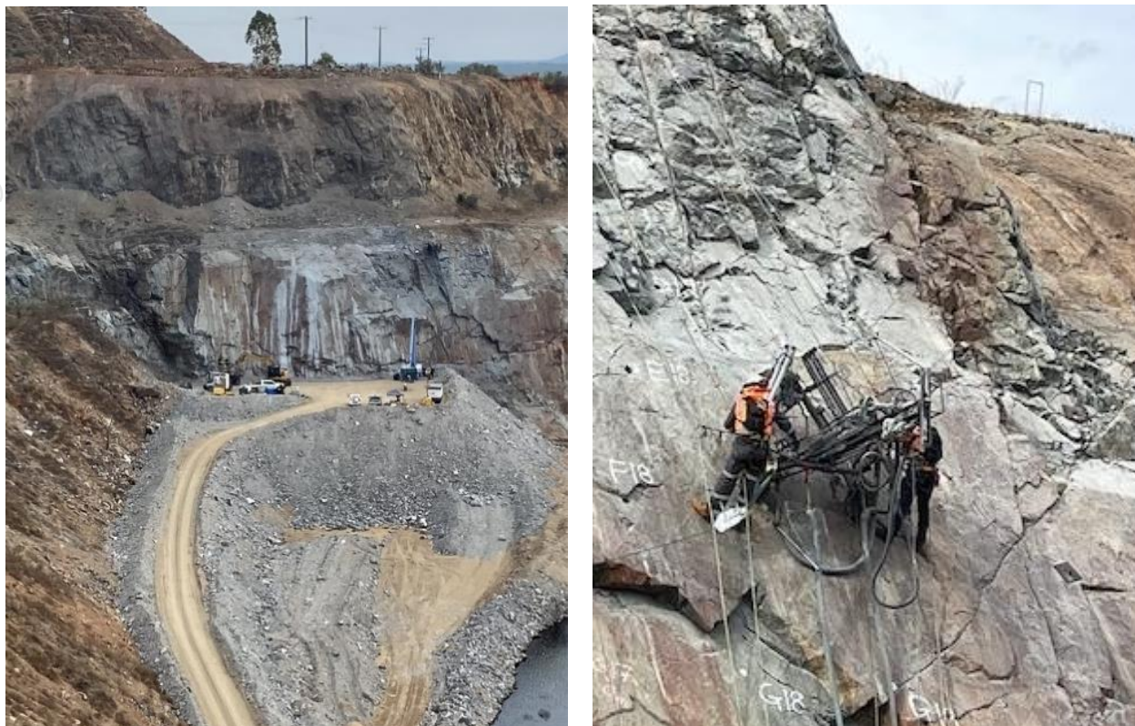
Figure 2: Drilling works ongoing for MAT Face Stabilisation