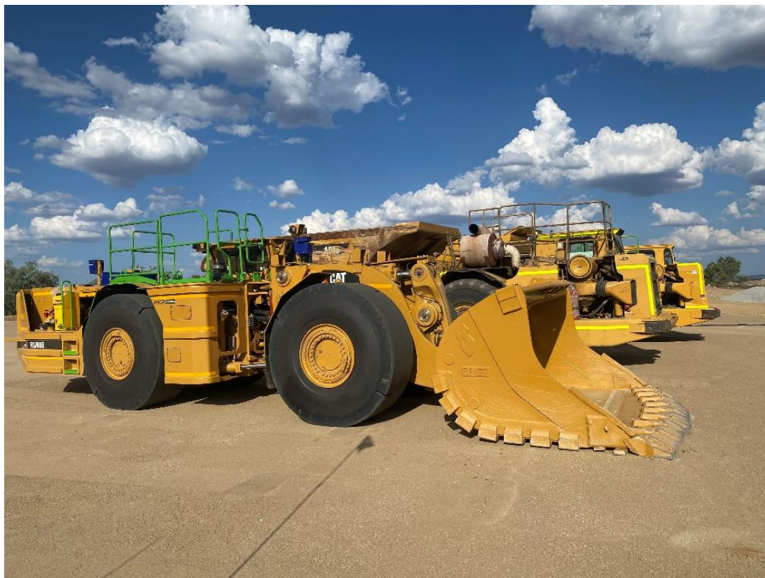
Figure 4: Mobilisation of Tunnelling Equipment