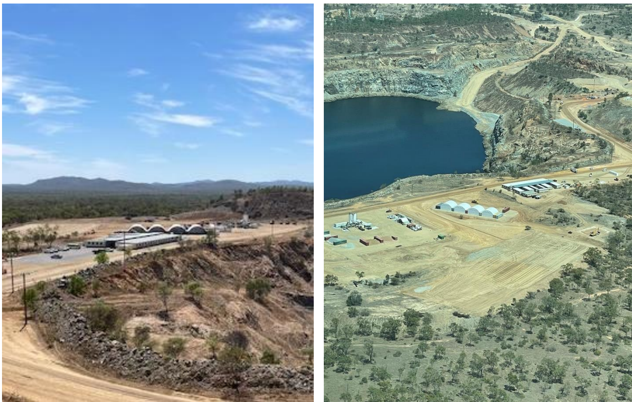
Figure 1: K2-Hydro site establishment works

Overall the construction program continues to track to schedule for first energisation in early CY2024 and completion in Q4 CY2024.