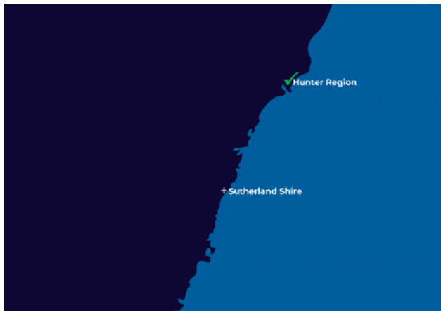
NSW Target Marquee Locations: 2 (completed: 1)