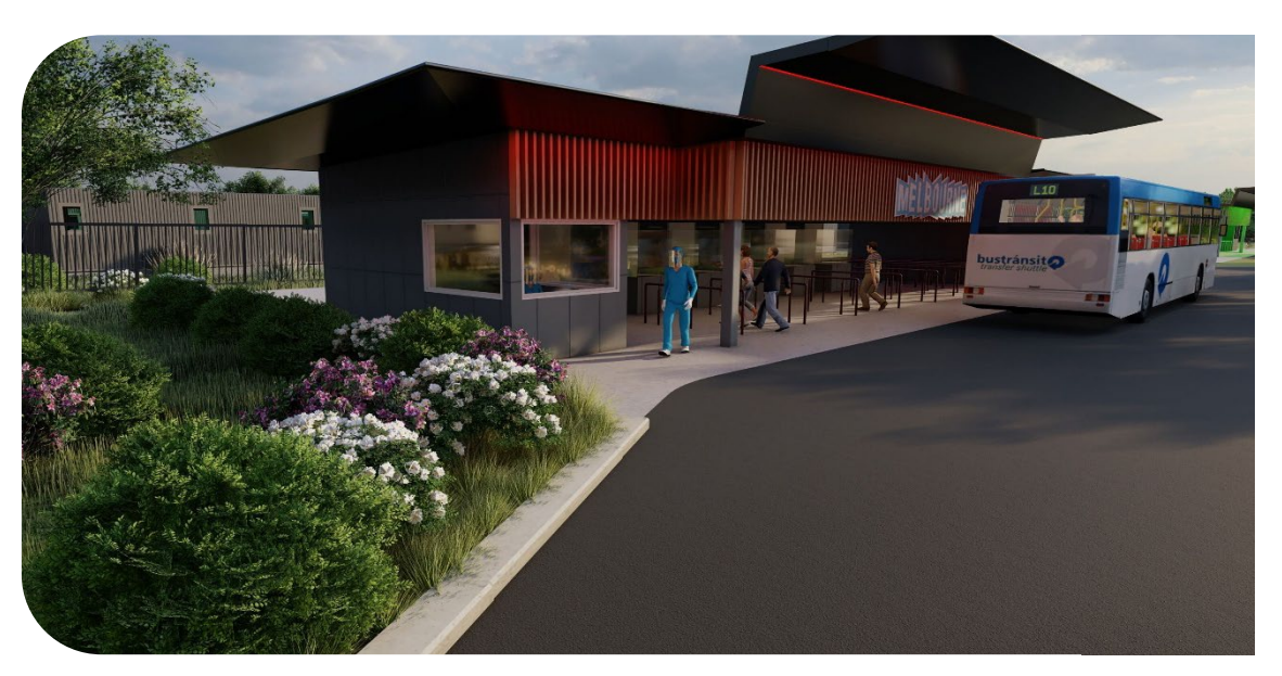
Centre for National Resilience, Victoria