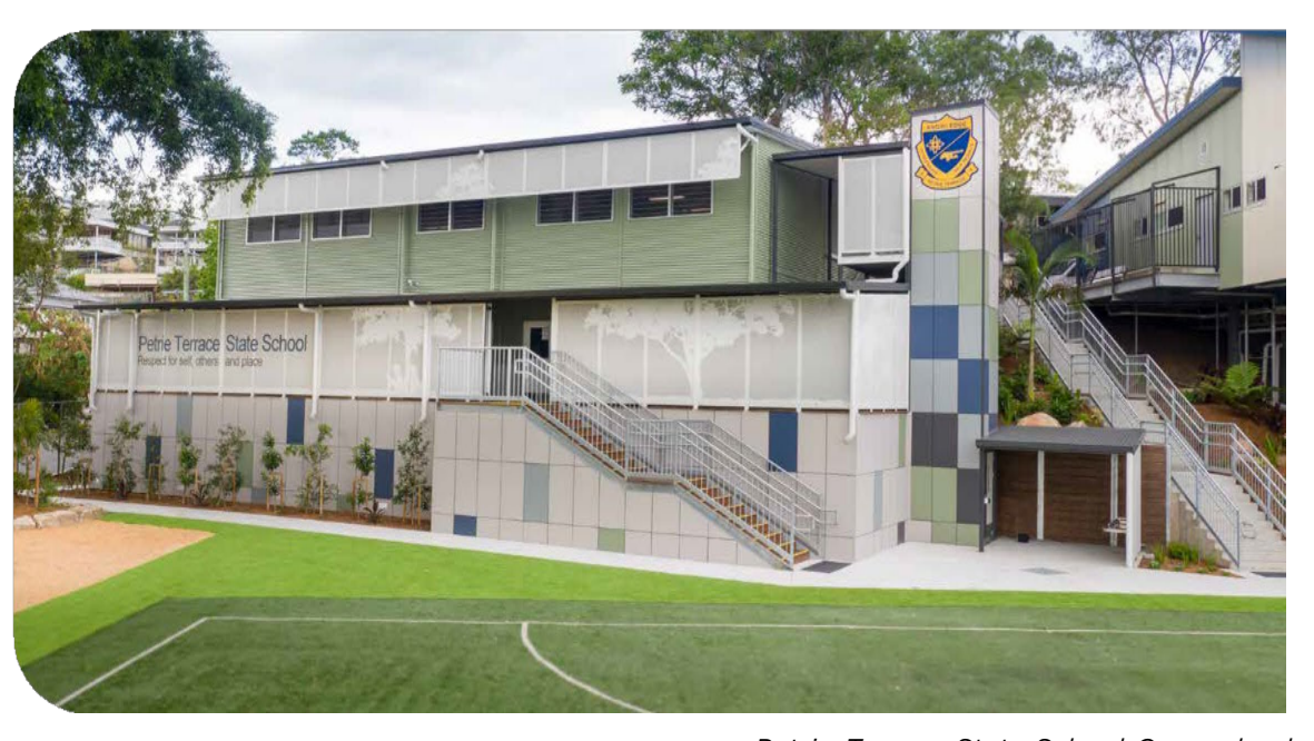
Petrie Terrace State School, Queensland