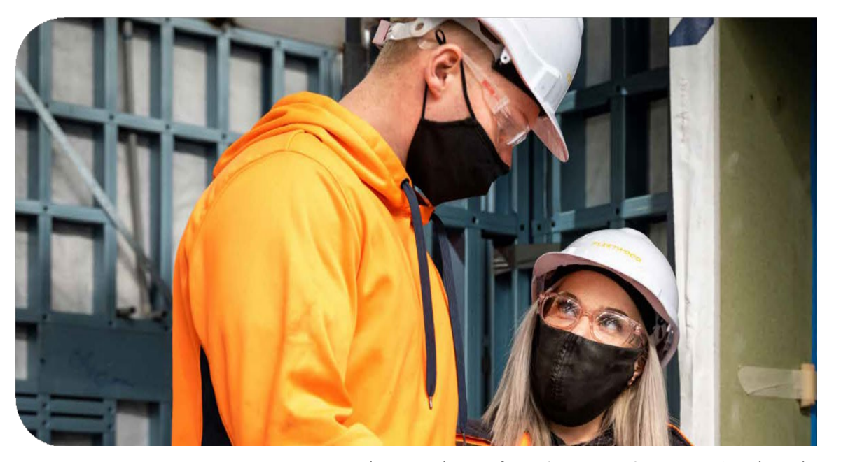
Fleetwood manufacturing operations, New South Wales