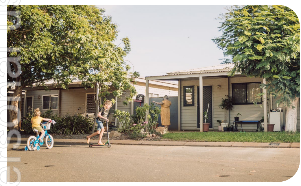
Osprey Village, Western Australia