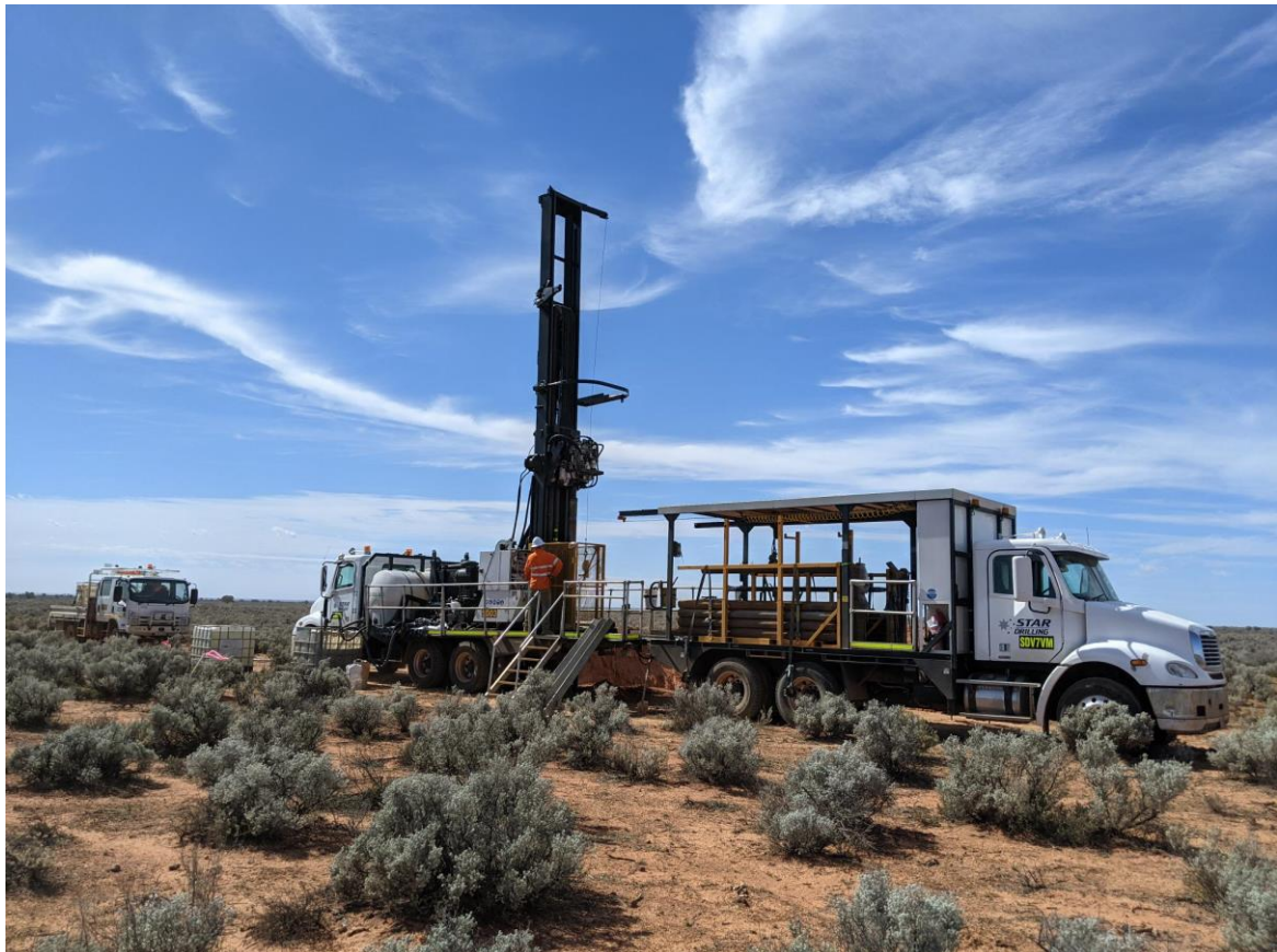
Figure 2 – Sonic core drilling rig on Blackbush deposit, Sapphire Uranium Project