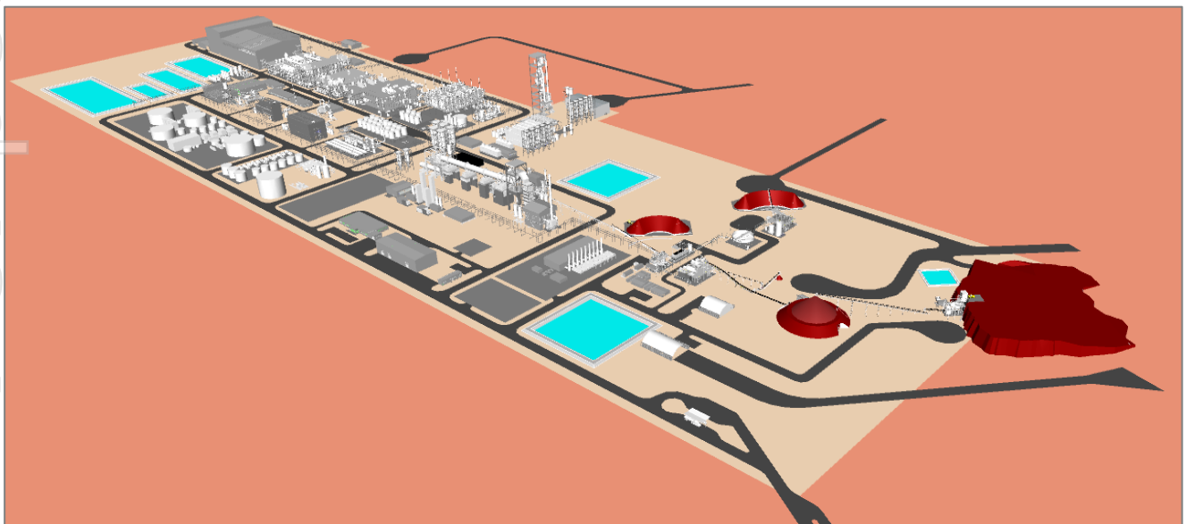
Figure 1: TNG's new Mount Peake Project integrated operation layout (south-east view)

Australian resource and mineral processing technology company TNG Limited (ASX: TNG ) ("TNG" or "Company") is pleased to advise that an integrated design layout for the Company's flagship Mount Peake Vanadium-Titanium-Iron Project ("Mount Peake Project" or "Project") in the Northern Territory, Australia, has been developed and delivered by Australian engineering and construction company, Clough Projects Australia Pty Ltd ("Clough").