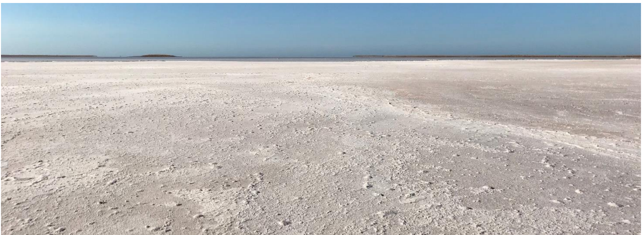
Figure 1: Salt crusted mudflats at Mardie (5km from coastline)

Mardie's footprint was planned approximately 5km inland from the coastline, resulting in the Project having minimal impact on coastal vegetation which includes algal mats and samphire flora. Barren mudflats make up more than 90% of the pond area, with another proportion of the final Project footprint covered by Mesquite, which is an introduced species and declared a weed in Western Australia. BCI will work with authorities to clear and eradicate the weed from specific Project areas.