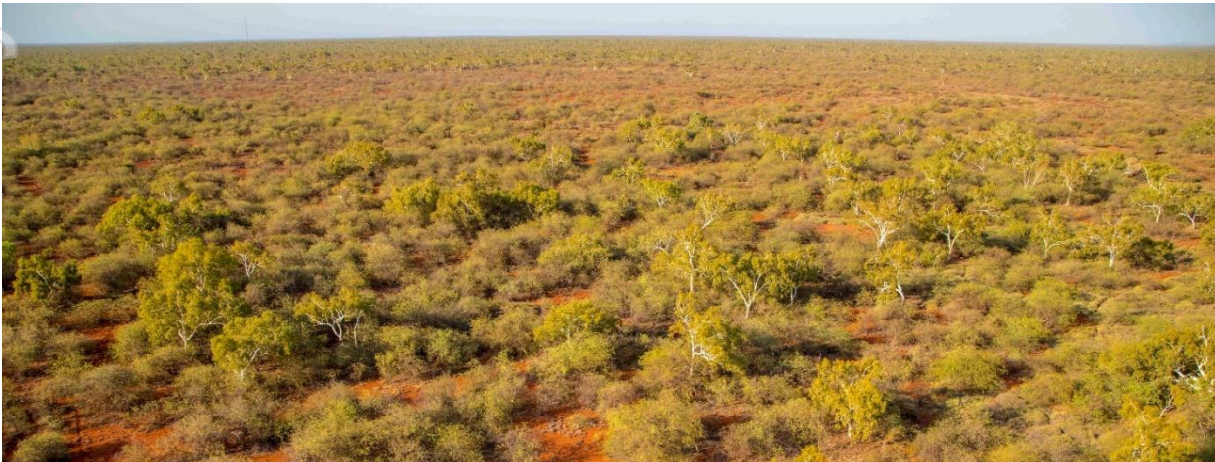
Figure 2: Mesquite – an introduced species and declared a pest in WA

BCI will now cooperate with various authorities to finalise the secondary approval assessments which will enable development to commence as proposed in the Environmental Review Document ('ERD') based on Mardie's Definitive Feasibility Study ('DFS') which included all land and marine areas for a 4.4Mtpa salt operation and its associated port facilities.