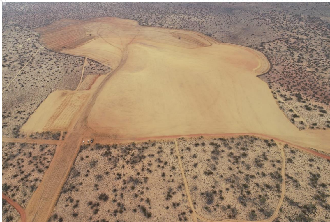
Figure 3 – Ambassador North looking east (18 November 2021)