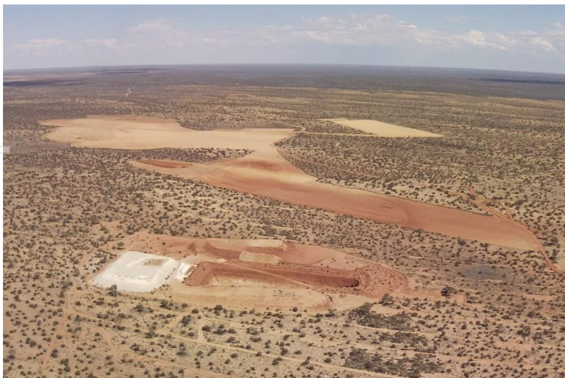
Figure 4 – Ambassador North and Ambassador East GIT looking north east (17 November 2021)