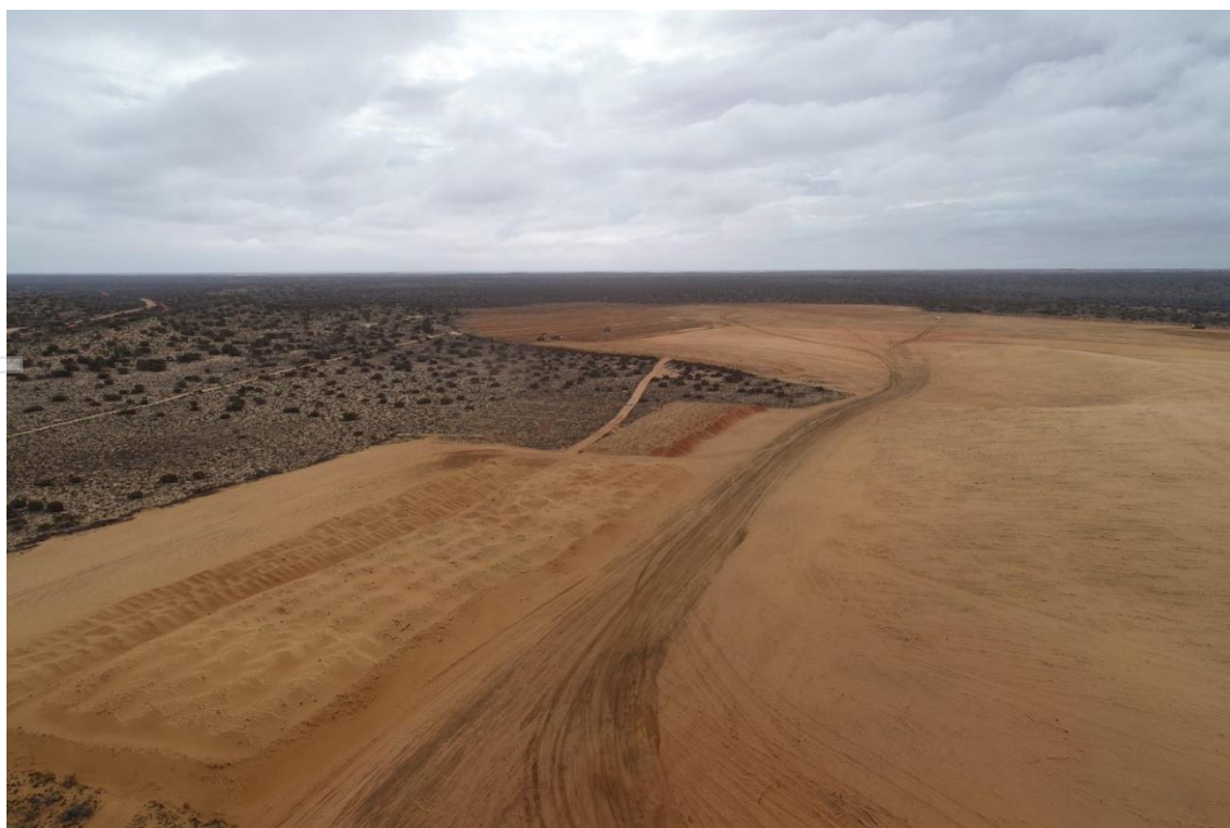
Figure 2 – Topsoil stockpiles at Ambassador North looking east (18 November 2021)