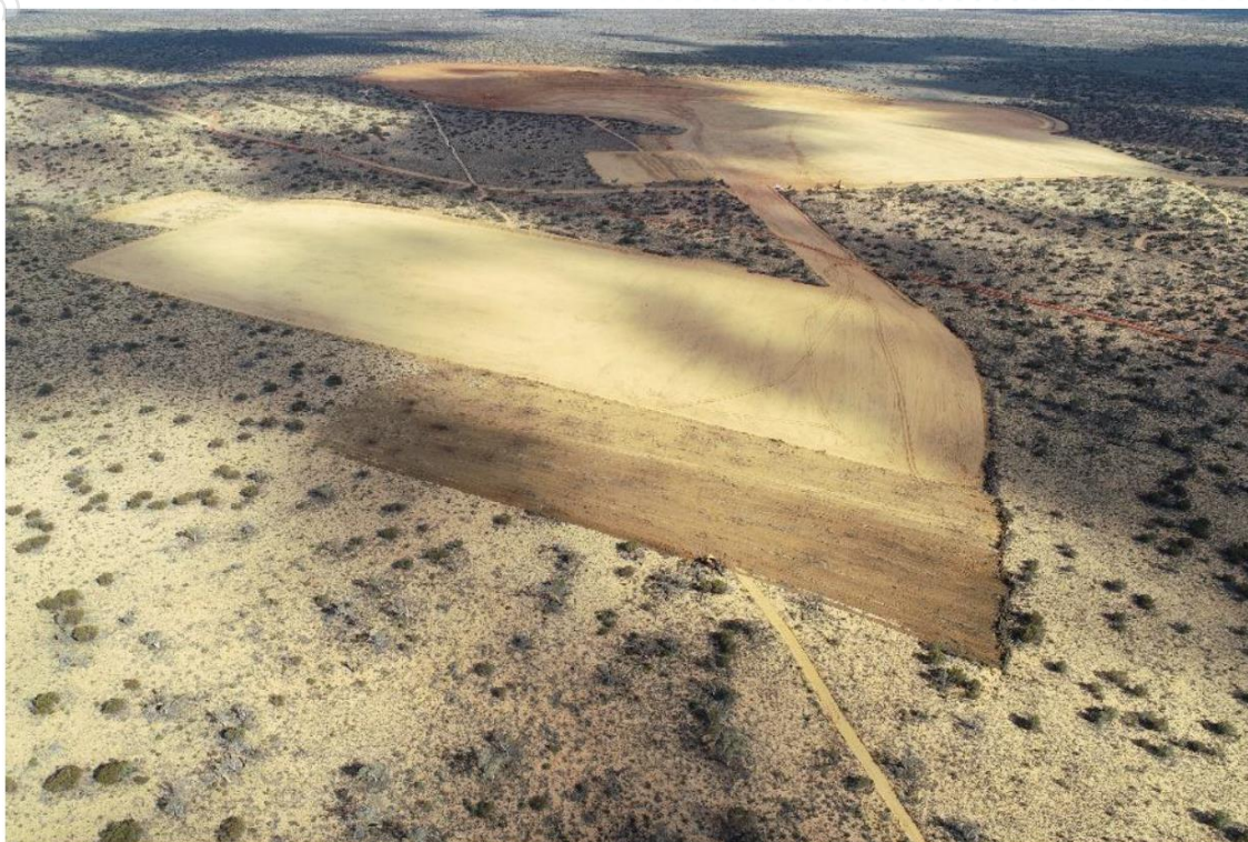
Figure 5 – Vegetation clearing at the Ambassador North extension (23 November 2021)