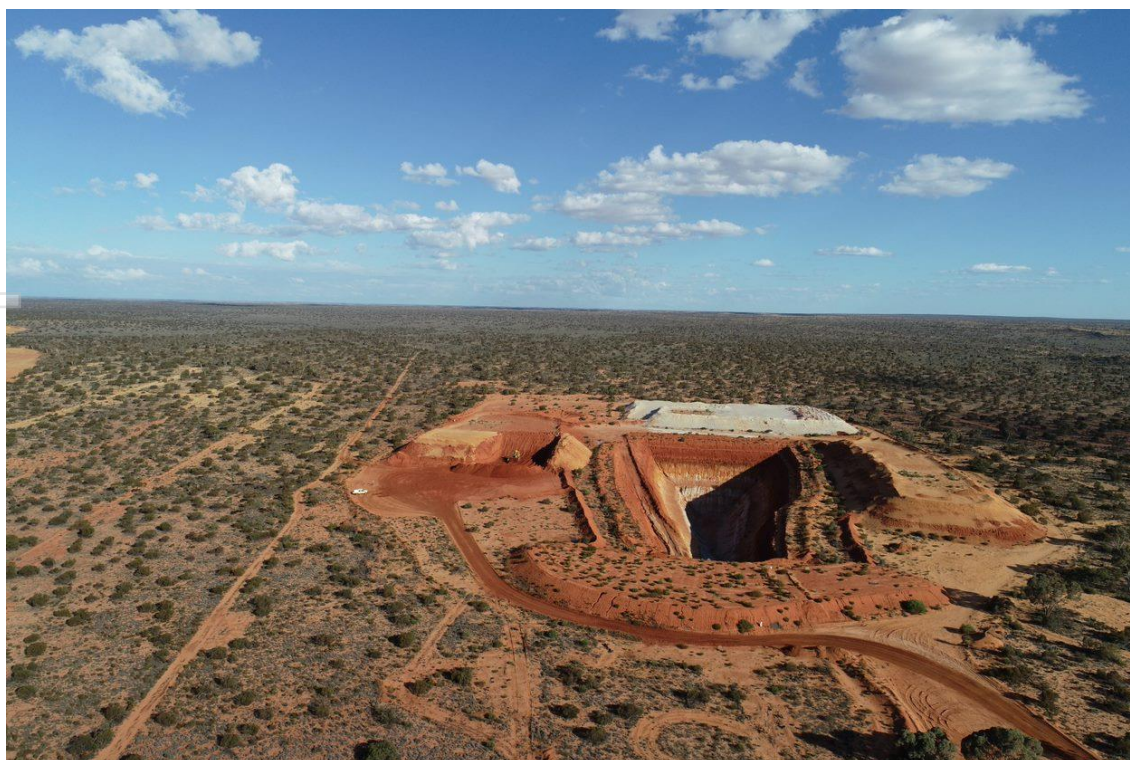
Figure 8 – Ambassador East GIT facing northwest (23 November 2021)