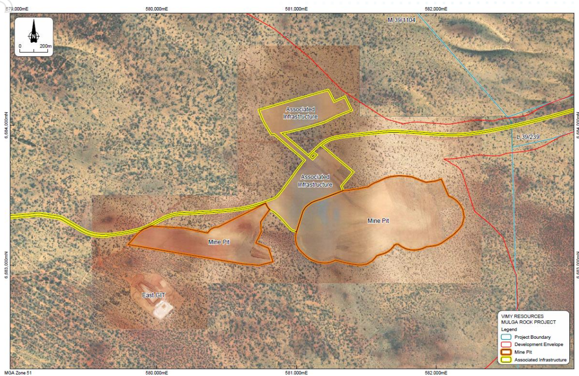
Figure 1 – Mulga Rock East (18 November 2021)